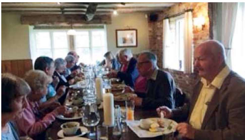
The Owl Kingsfold Lunch Club Visit