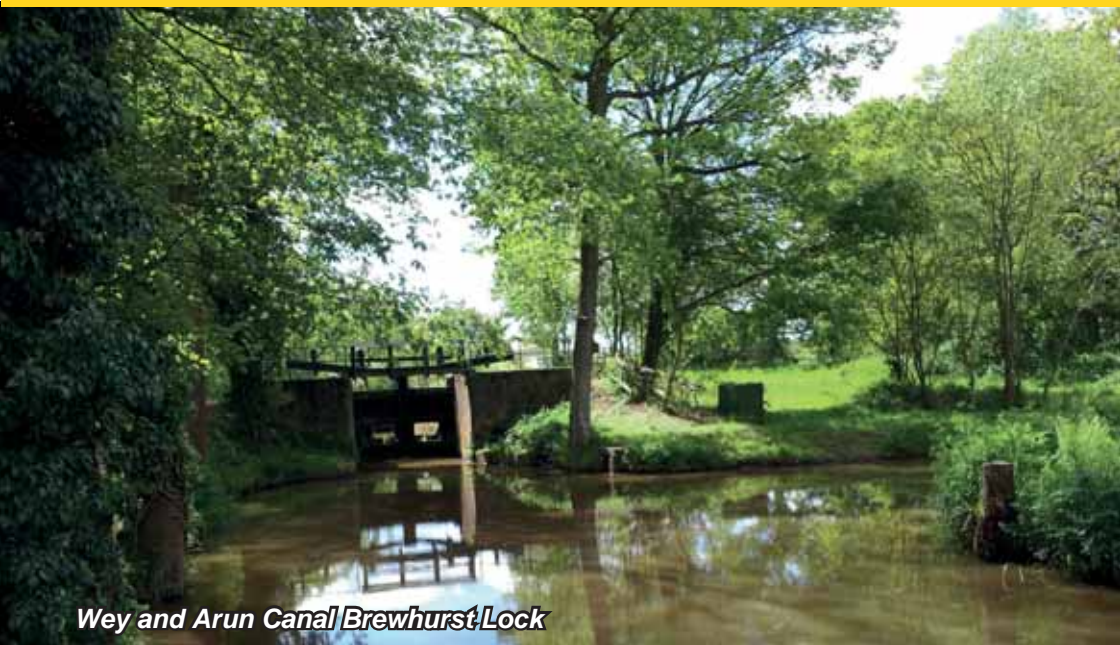
Wey and Arun Canal/Brewhurst Lock