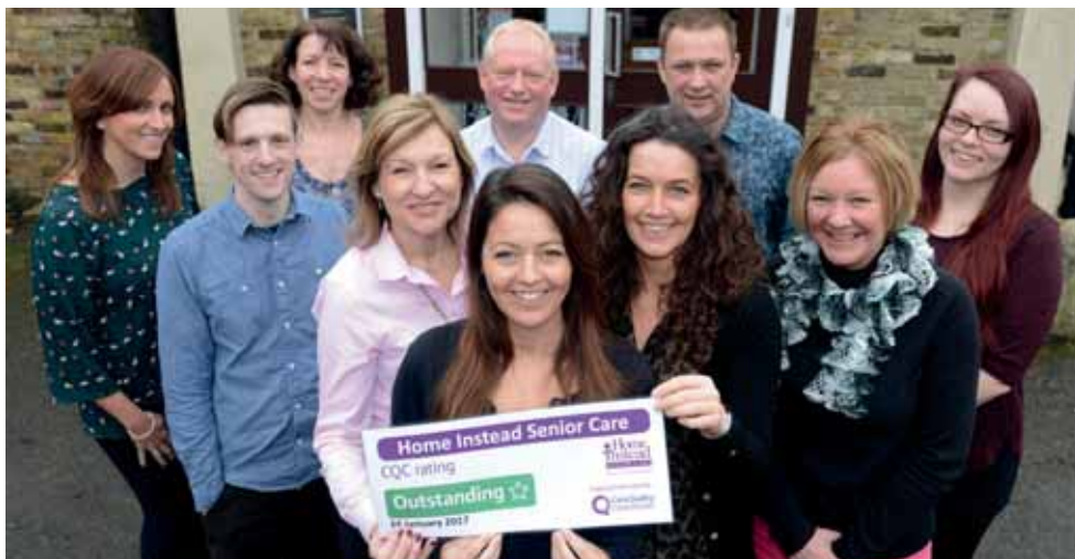
Our local Home Instead