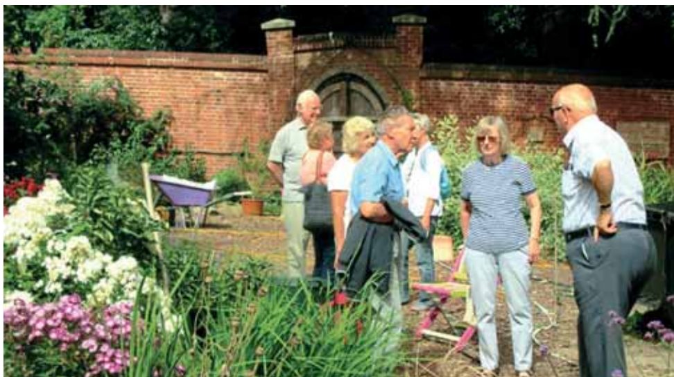
Patchworking Garden Visit

These are some of the members enjoying events this year