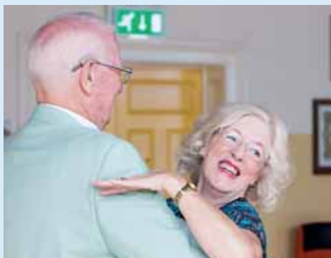
Dancers show off their footwork

The importance of friendship in helping us lead happier and healthier lives was celebrated with an afternoon tea dance in Dorking organised by members of the Mid Surrey District Oddfellows Friendly Society, as part of the organisation's nationwide Friendship Month.