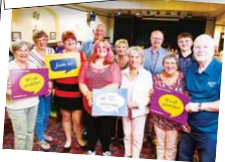
Brighouse and Huddersfield Oddfellows