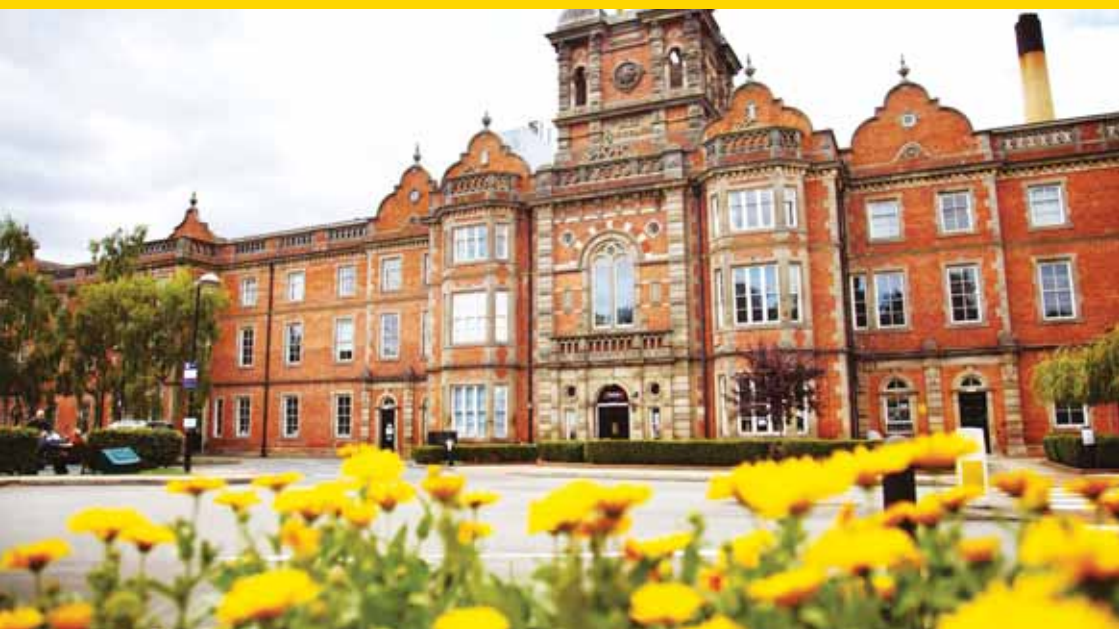
Thackray Museum - Leeds