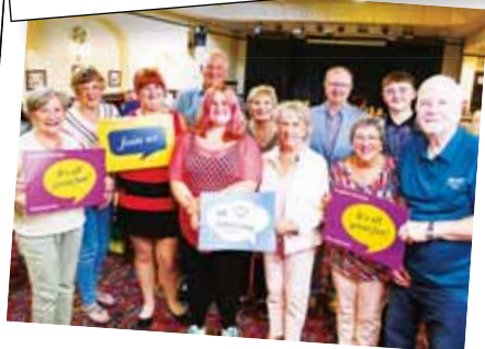
Brighouse and Huddersfield Oddfellows