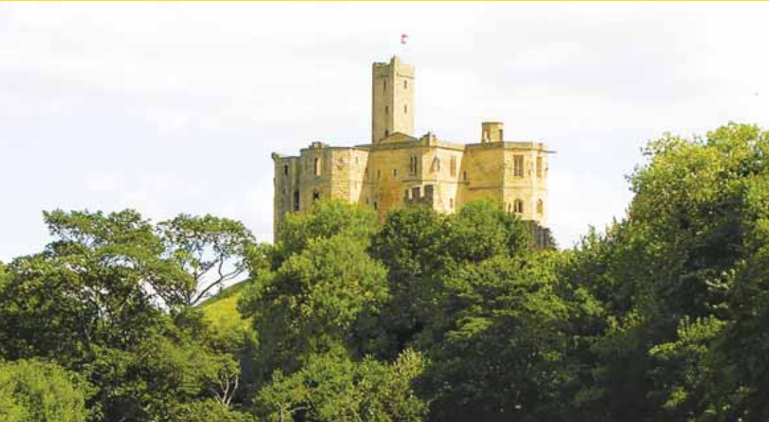
Warkworth castle, Northumbria

Northumbria Branch Covering Northumberland, Tyne and Wear