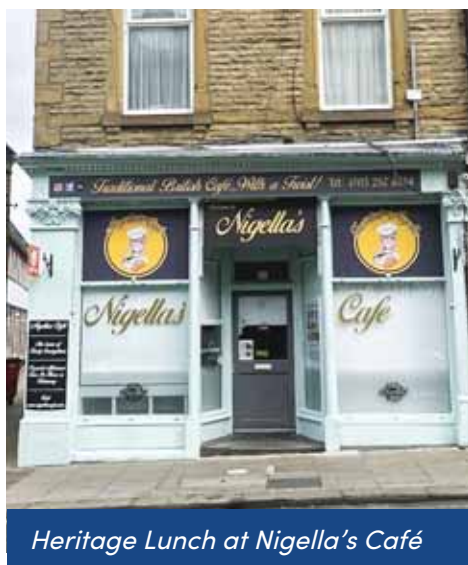
Heritage Lunch at Nigella's Café

We have included a handy back page listing month by month for events at a glance.