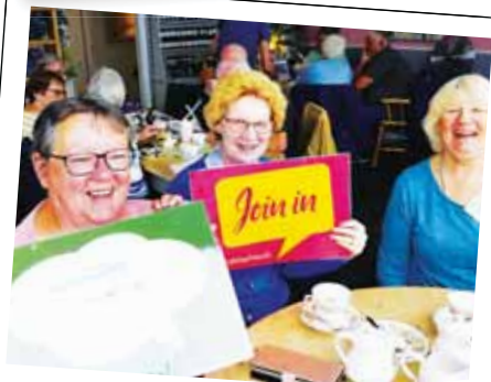
Heart of the West Oddfellows