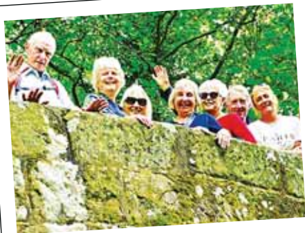
Derbyshire Peak Oddfellows