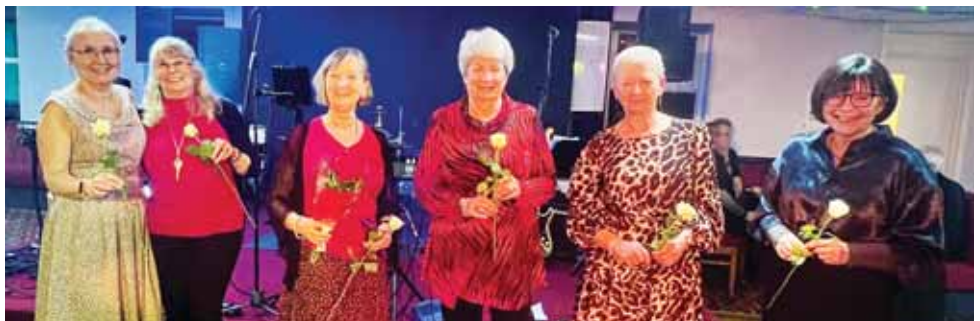
Members with their roses.