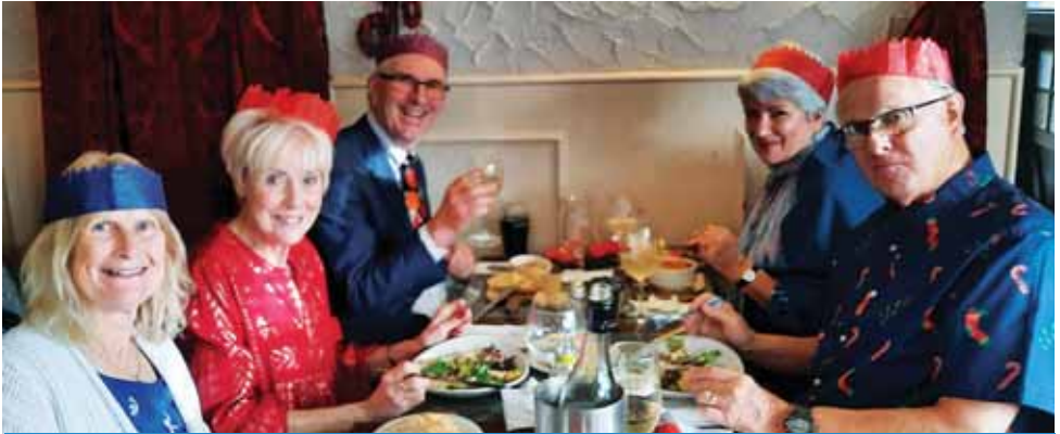
Members enjoying their lunch.