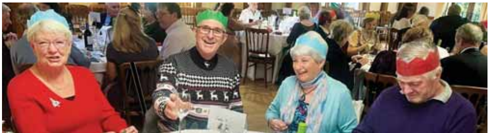
Members at High Rocks.