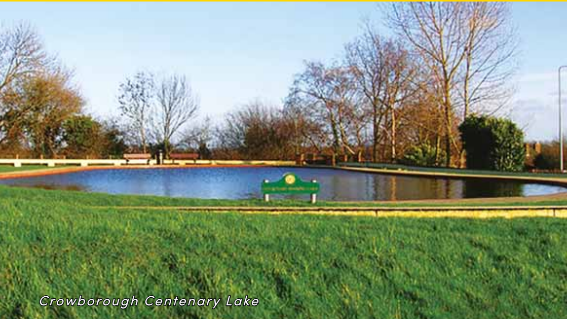
Crowborough Centenary Lake