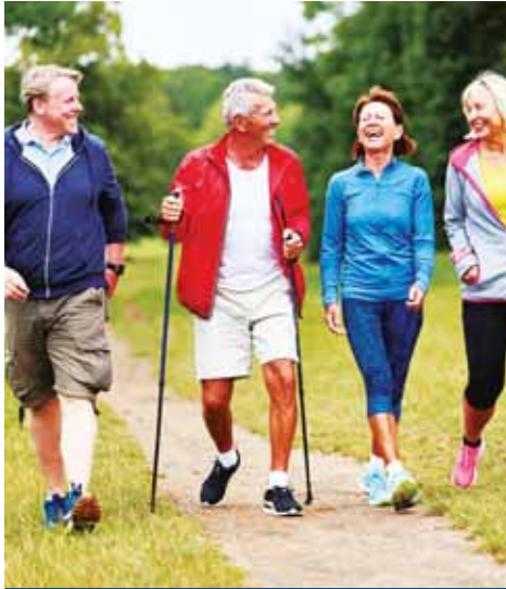
Friendship Ramble and Pub Lunch Saturday 19 September