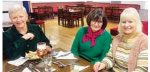
Members enjoying lunchtime friendship.

In January, a lovely and chatty lunch was attended by fourteen members who enjoyed paté or prawn cocktail, followed by salmon or beef pie, with fresh fruit salad or ice cream for dessert. The lunches are really good value for money and everyone enjoyed themselves.