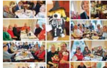
Friendship Lunchtime Get-Together