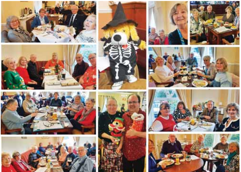
Getting into the Friendship spirit.

At each of the lunchtimes, members were able to purchase their own food varying from baked potatoes and poached salmon, to pies and lasagne, with the Branch paying for a drink. In December, the Club put on a two-course festive carvery for thirty-eight members and two guests that was very well received. Much fun and laughter was had by all present at each event. A raffle was also held each time for our Charities of the Year – St Catherine's Hospice and Compass Gardens, East Grinstead.