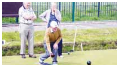
Members enjoyed the Roy Harmer Bowls Tournament.

Hosted by Brighton and Sussex Oddfellows, there were a number of social activities in the schedule too. Before business got underway, members and the public were treated to another fantastic performance by Oddfellows Brass – a high point for many each year. Other events held throughout the week included the black and white-themed welcome evening, a church service where remembrance wreaths were laid, a day trip to Rye, a bowls tournament, and the Farewell Dance.