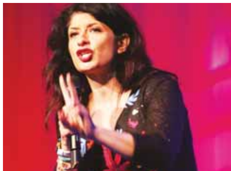
Shaparak Khorsandi: 'It was the 90s Comedy' - Saturday 9 July