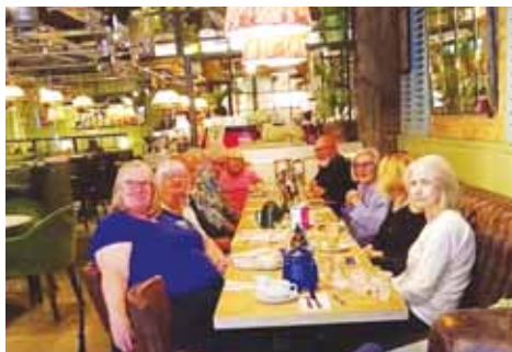
Brunch at Bill's Camberley.