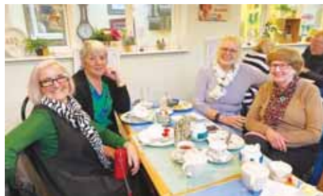
Coffee mornings at Daisy's Tea Room at Fleet.