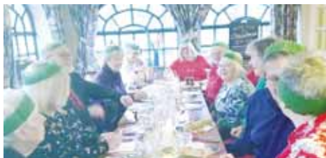
Just one of three Christmas lunches in December 2021 – this one was our favourite – The Princess Royal at Farnham!