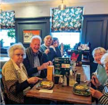
A few members met at The White Hart in Buckingham for lunch. There was a lot of giggling involved as you can see.

months including our annual BBQ in September at the Verney Centre where we hope to see as many of you as possible.