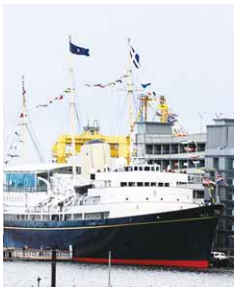
Royal Yacht Britannia - Edinburgh.

The weather was glorious, warm and sunny, so many took advantage of that to relax on the terrace enjoying a few games with friendship and fellowship. Wednesday was an early start as the destination that day was the Royal Yacht Britannia. Again we passed through some stunning scenery on our journey but the star of the day was Britannia. Everyone who went thoroughly enjoyed the experience. It was made all the more vivid with the excellent audio guide giving an interesting insight into life on board for the late Queen and her family.