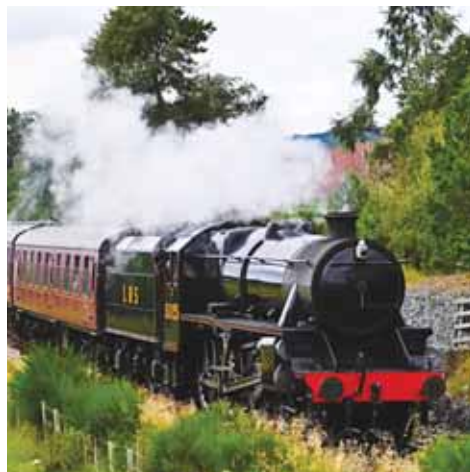
Strathspey Steam Railway.