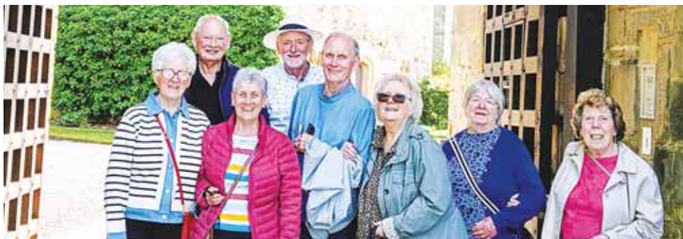
Just the place for a photoshoot! Members at the Castle Gates looking forward to the tour.