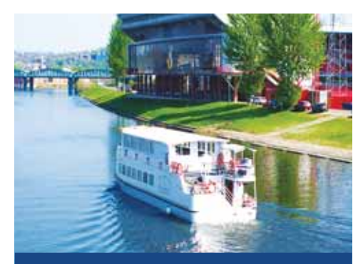
Sunday 28 July – Sunday Lunch on the Nottingham Princess, we hope you can join us!

I am pleased to say that we have joined up with Derbyshire Peak for some of their events, Denby Pottery visit being one of them. See page 21 for details of some of their