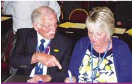
A little advice before the Annual Movable Conference starts.

Your Editor affectionately remembers past and present members.