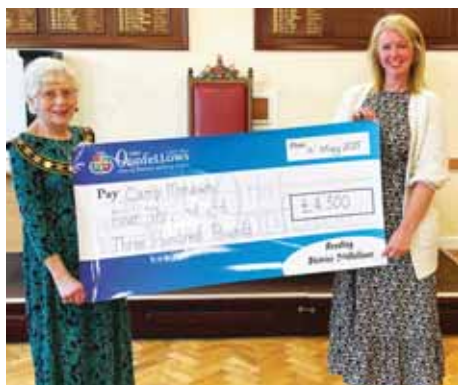
Reading Oddfellows donated £4,300 to Camp Mohawk

Oddfellows branches and members are avid fundraisers. In 2025, more than £148,000 was handed over to a huge range of wonderful causes throughout the country.