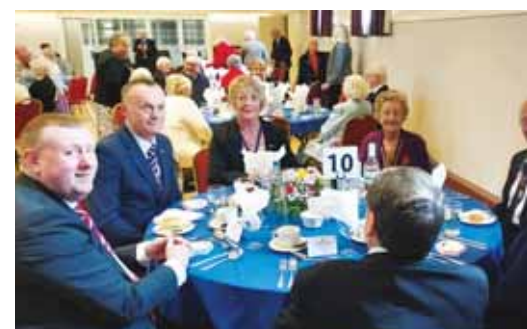
Nene and Welland Annual Dinner