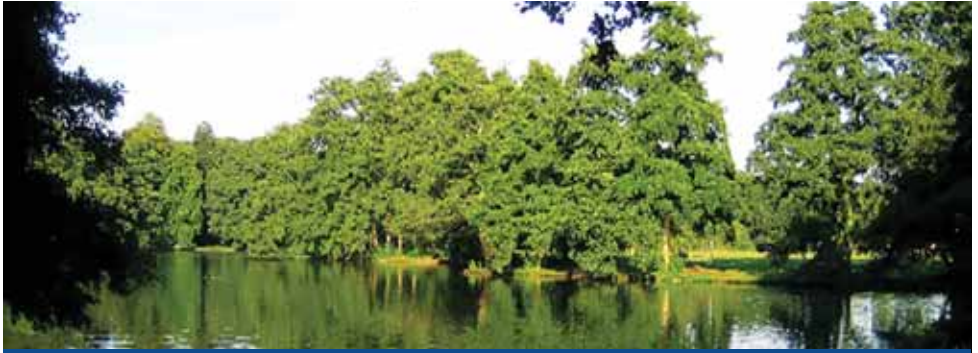
Friendship Walk around Boutham Park - Thursday 17 September