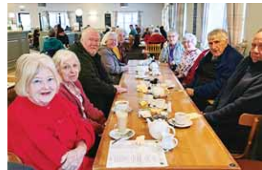
Lincoln Dine Around