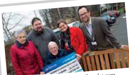
North Gloucestershire District Branch present Cheltenham hospital with £6,640.

There's always a need for an extra pair of hands, whether you're rounding up the troops, baking some delicious goodies, or tidying up after an event – your time is just as valuable to charity fundraisers as any money you're able to donate.