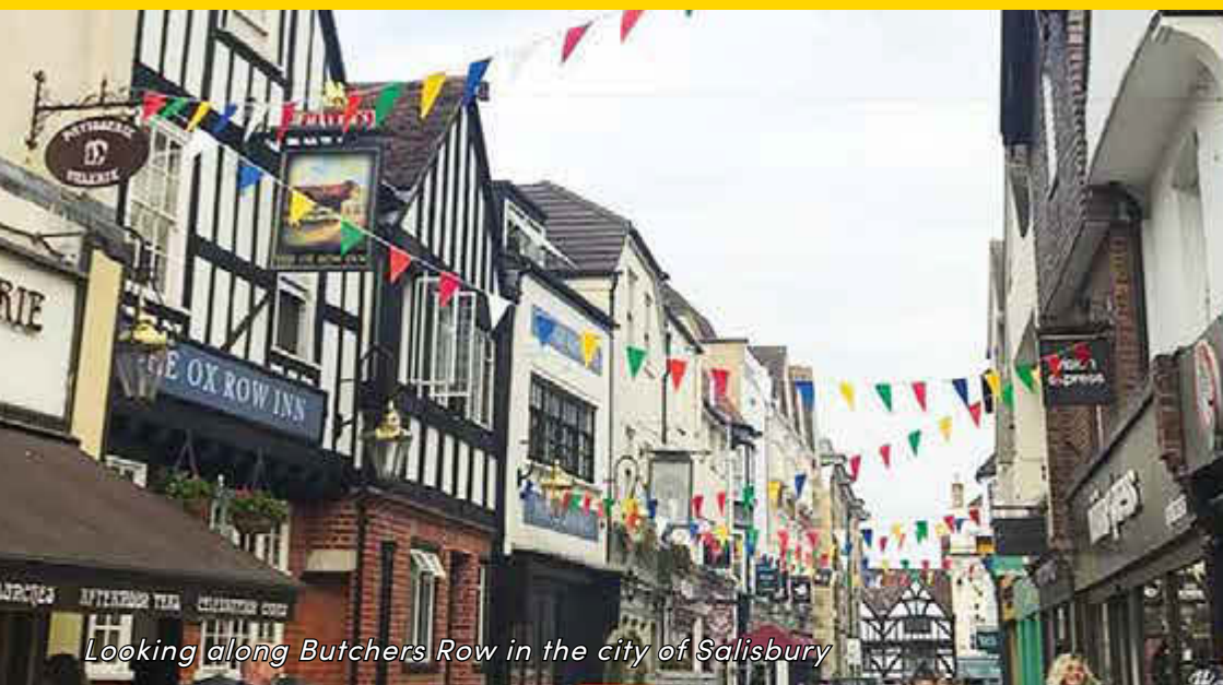
Looking along Butchers Row in the city of Salisbury