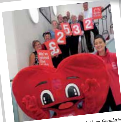
Oddfellows raise £2532 for the British Heart Foundation