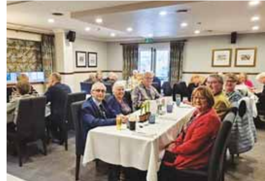
Capital of the Fens Annual Lunch