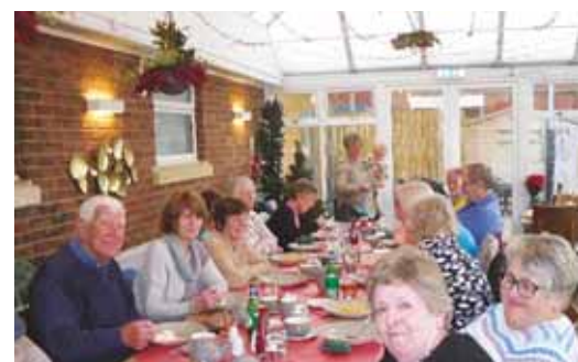
Boston and Lincoln Dine Around