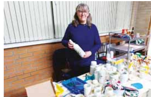
Lincoln Branch Event