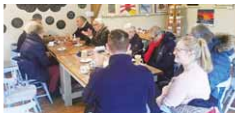
Coffee morning in Elham at the Fifth Trust Café, 24 January 2022.

We've also been meeting regularly in Canterbury, Folkestone, Sandwich and Elham for coffee and food, which has been a lovely opportunity to reconnect with many of you.