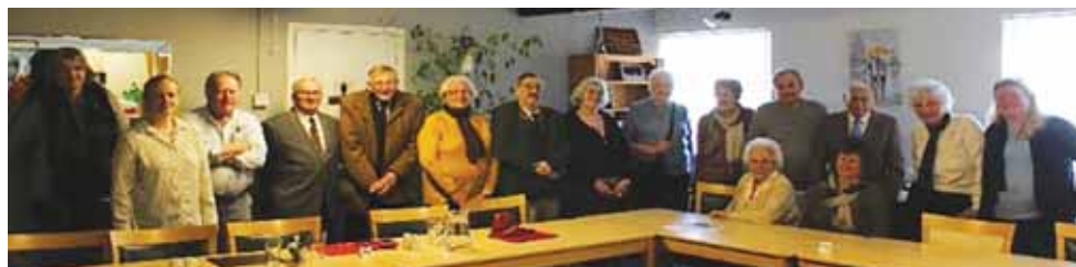
Lunch Club in the Age Concern in Sandwich, 7 February 2022.

Another fine venue we have also utilised more this year, is the Folkestone Bowls Club. Please see below for more details.