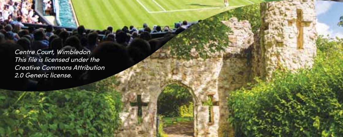
Reigate Castle

Centre Court, Wimbledon This file is licensed under the Creative Commons Attribution 2.0 Generic license.