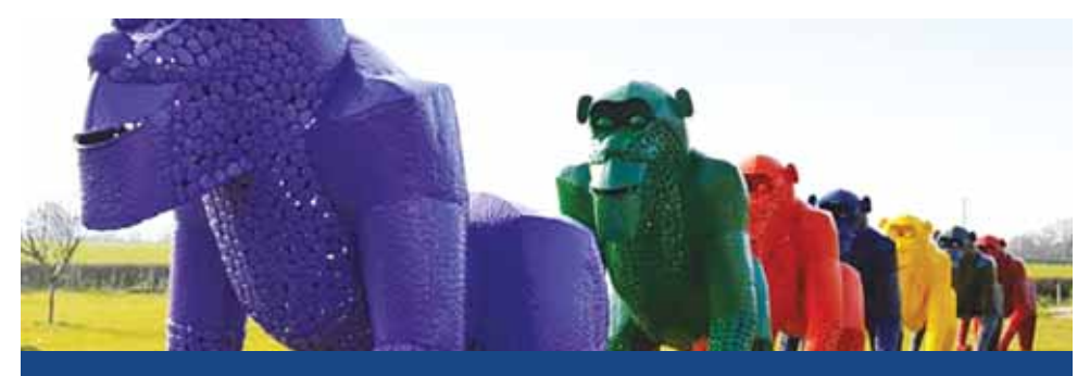
Buffet Lunch at the Oswestry Ironworks - Wednesday 14 August

Welcome to the latest edition of the Oswestry District Events Diary. Members of the District have organised a varied programme of events for you all.