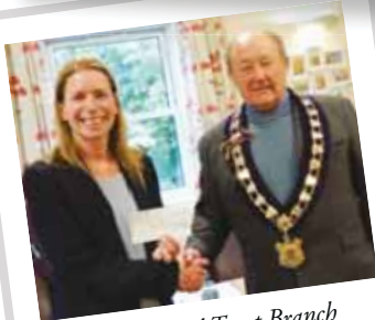
Severn and Trent Branch donated £1,000 each to both The Shrewsbury Ark and the Newport Cottage Care Centre.