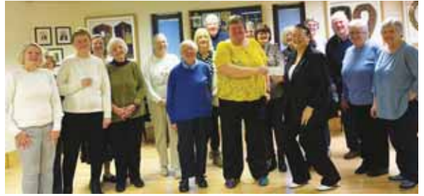
Leeds Branch donated £462 to Hidden Homeless.