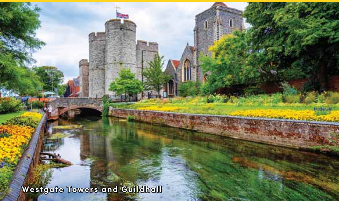
Westgate Towers and Guildhall