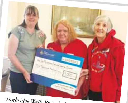
Tunbridge Wells Branch donated £1,000 to the Pickering Cancer Trust.

Find out more about the Society's on-going charitable giving, including how we're supporting the University of Southampton Centre for Cancer Immunology and the RNLI, by visiting www.oddfellows.co.uk/about/givingback