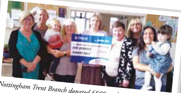
Nottingham Trent Branch donated £500 to the Netherfield Parent and Toddler Group.