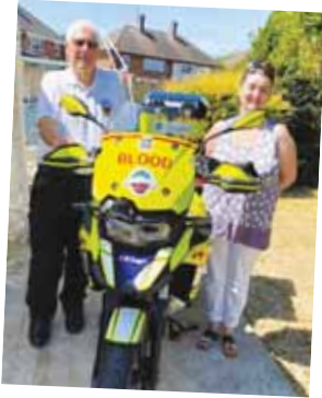
Derby Branch donated £7,810 to Derbyshire Blood Bikes, which was used to purchase the pictured bike.