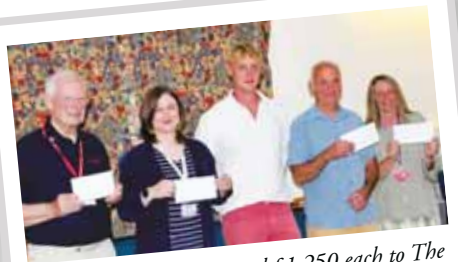
Trafalgar Branch donated £1,250 each to The Benjamin Foundation, The Hamlet Centre Charity, the Norfolk and Norwich Liver Group and the North Walsham Community Shop.