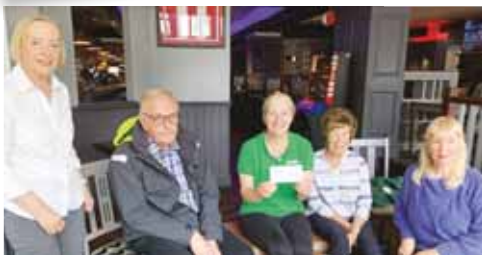
Handforth and Altrincham Branch donated £100 to Macmillan Cancer Support in memory of much-loved members who have recently died from cancer.