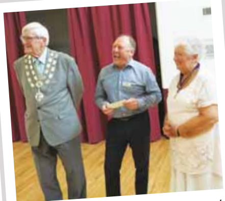
Erewash Valley Branch donated £418.63 to the John Eastwood Hospice in Sutton in Ashfield.