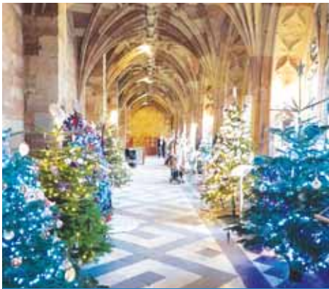
Christmas tree exhibition at Worcester Cathedral.