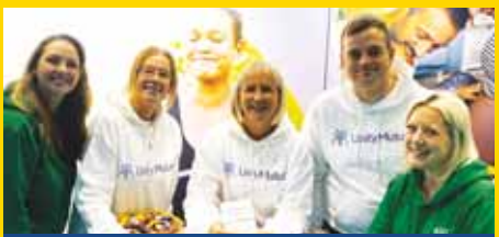
Unity Mutual at the Baby and Toddler show

The Junior ISA (JISA), offered in partnership with Mini First Aid to include a free paediatric first aid course*, turned heads, especially when parents realised once they’d set it up, anyone could contribute.