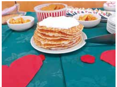
Pancakes on Valentine Day.