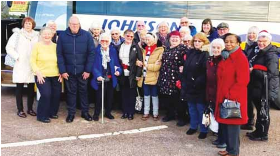
Members on a trip to Worcester before Christmas.