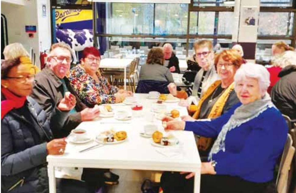
Members on a trip to Cadbury World last November.