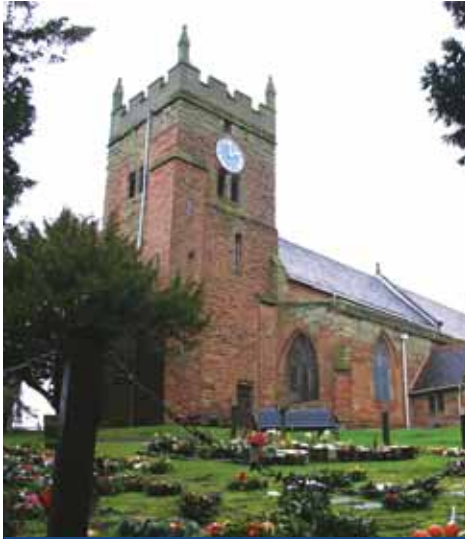
Heart of England & Midland Group District Church Service Sunday 7 July