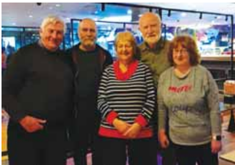
Some of our members at a ten pin bowling afternoon, this January.