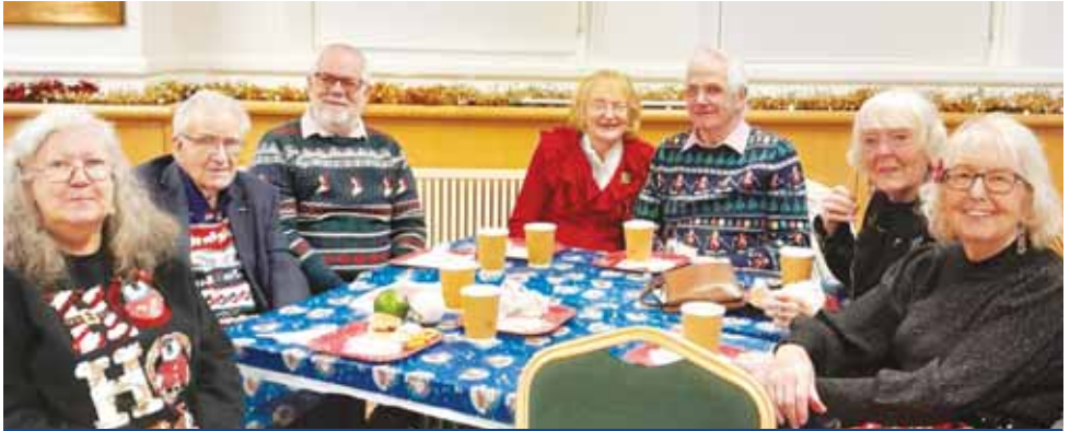
Members at the Christmas party 2023.