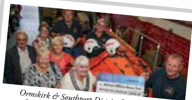
Ormskirk & Southport District Branch present Southport Offshore Rescue Trust with £775