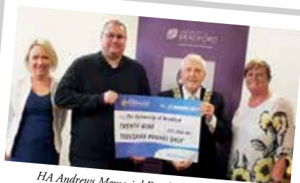
HA Andrews Memorial Fund presents University of Bradford with £29,000