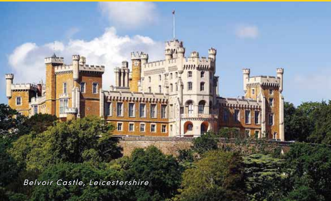
Belvoir Castle, Leicestershire