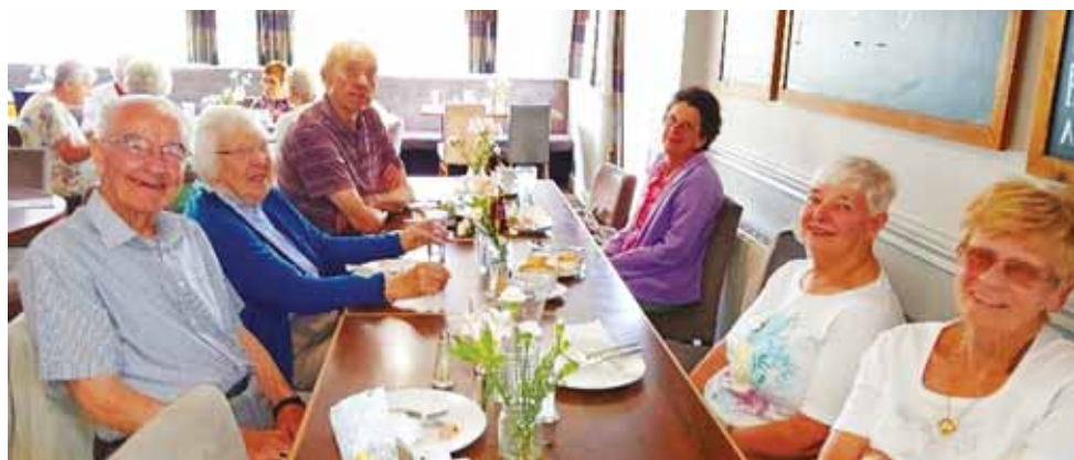
Some of the Open Hand members at the Whetstone Golf Club.