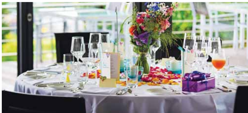
Pride of Leicestershire Annual Friendship Lunch - Saturday 20 September

Welcome to the latest edition of the Events and News of the Pride of Leicestershire District Branch. Members of the District have organised a varied programme of events for you all.