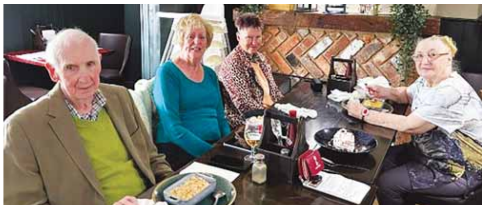
Some of the Earl Howe members enjoying their lunches out.

0116 2543106 if you would like to come along to one of them. Details are in the diary pages.