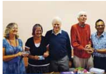
An Evening at the Races