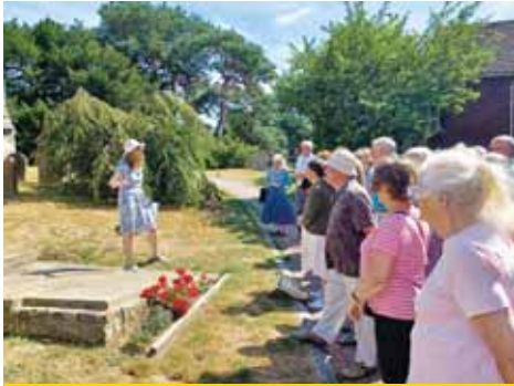
Members at St Swithun's.

in Horley as a Fire Safety Officer. A very interesting and entertaining talk.