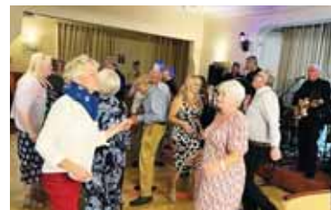
Friendship Dinner Dance