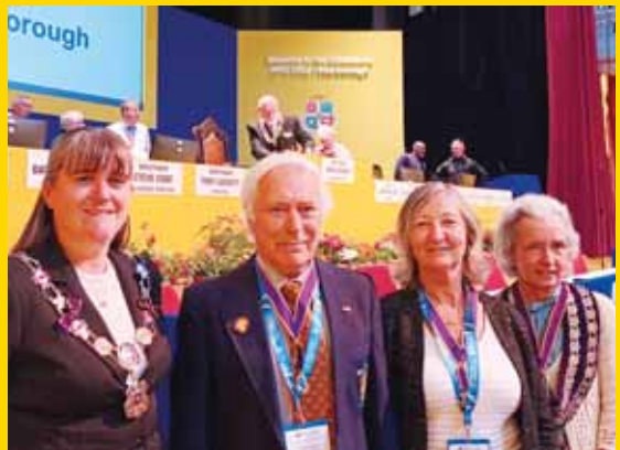
Deputies at AMC 2022.