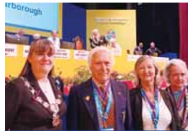
Annual Movable Conference