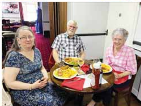
Lunchtime get-togethers at Crowborough Social Club.