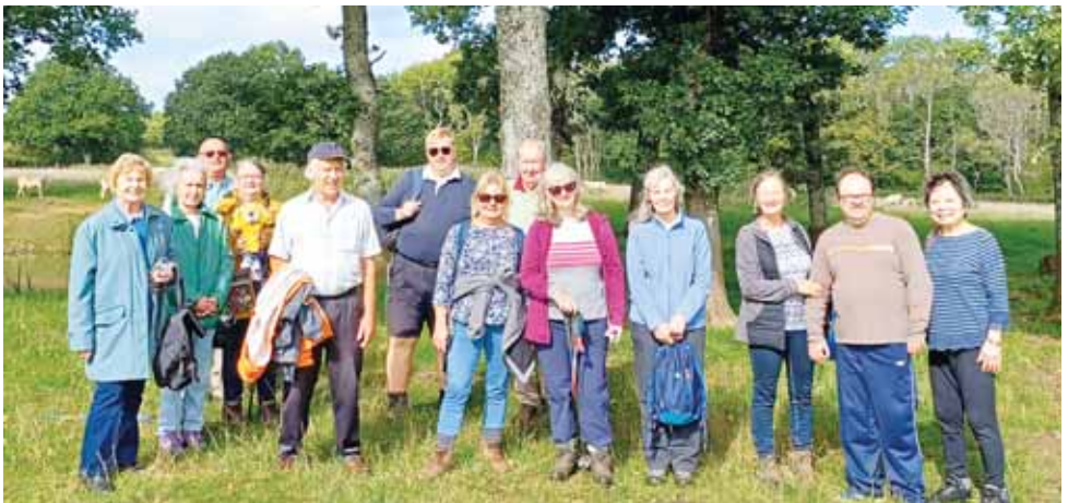
The Fountain Inn Ramblers.

Sixteen members and a guest enjoyed a relaxing 6km (3.7 mile) circular walk from The Fountain Inn in Cowden. The walk followed some of the Sussex border path and thankfully there were no stiles this time but we did see lots of sheep. The weather was warm but not too hot. Afterwards, a refreshing drink was had at The Fountain Inn followed by a delicious meal.