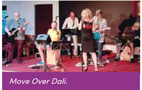
Move Over Dali.

In July, twenty-five members gathered to enjoy an evening of music provided by the six-piece band Move Over Dali. The band played a mixed selection of reasonably familiar songs including Only You, Wherever I Lay My Hat, and Baby Come Back, as well as several rockabilly songs and some songs that had been written by one of their own members. Despite it being a very hot day, several members took to the dance floor.