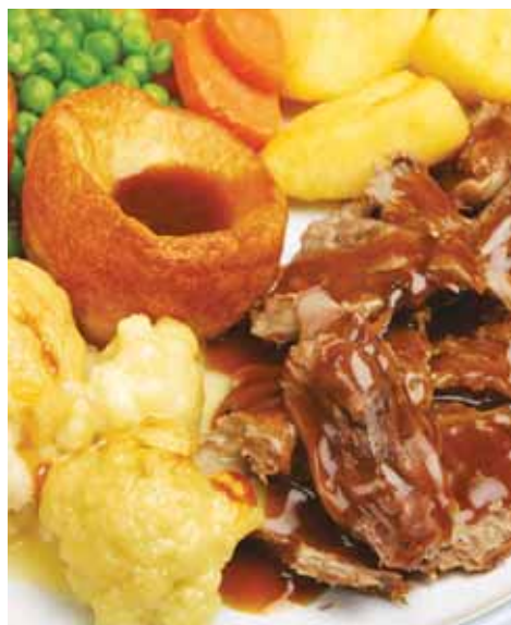
Sunday Lunch – Sunday 12 March