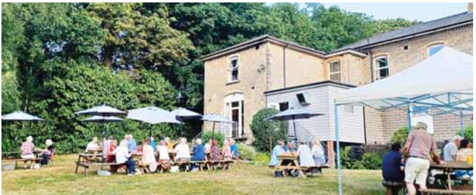
Members at the BBQ.

a variety of salads plus dessert. Everyone had a very enjoyable time at this informal social occasion and everyone chose to take advantage of the warm summers evening by sitting outside in the extensive grounds of the club.