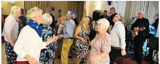
Members dancing to The Heartbeats.

Notwithstanding that they had to bring in a substitute guitarist as one of their regular members had very sadly passed away only a week before, the band put on an excellent show, playing many popular songs from a range of eras, most of which were well suited to the sort of "dancing" most of our members are able to