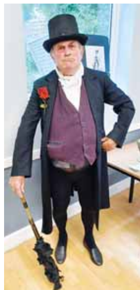
Mad Jack Fuller.