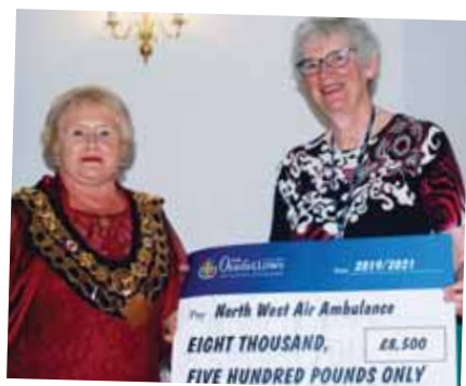
South East Lancashire Branch

Oddfellows CEO, Jane Nelson, added: "It always astounds me when we look at the collective yearly fundraising figure. The generosity of our members and Branches, especially at such times where household budgets are becoming increasingly tight and unpredictable, is incredible.