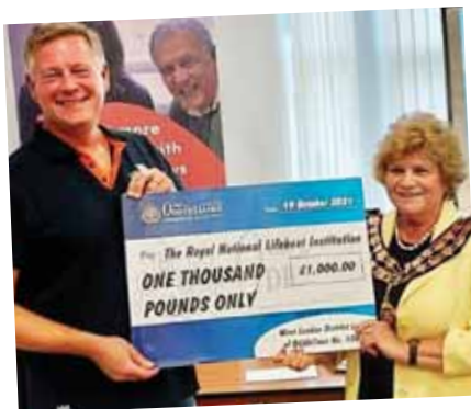
West London Branch