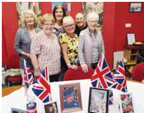
Morning coffee celebration at Heart of Egremont. (We'd finished all the food before I remembered to take a photo – Ed).