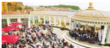
Oddfellows Brass on fine form

Thanks go to all who attended, debated and voted on the different clauses and to those working behind the scenes who made the conference such a success.