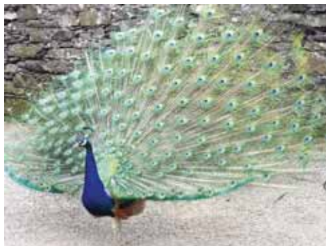
One of the many Peacocks on display.

The first recorded owner of Gwydir was Howell Coetmore who fought in the Hundred Years War and died at Flanders in 1388. The current owners were born in the next village along and after coming back from living in London were looking for a nice cottage to settle down in.