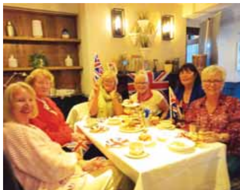
Cheers Your Majesty! Members at Childwall Abbey finishing their afternoon tea.