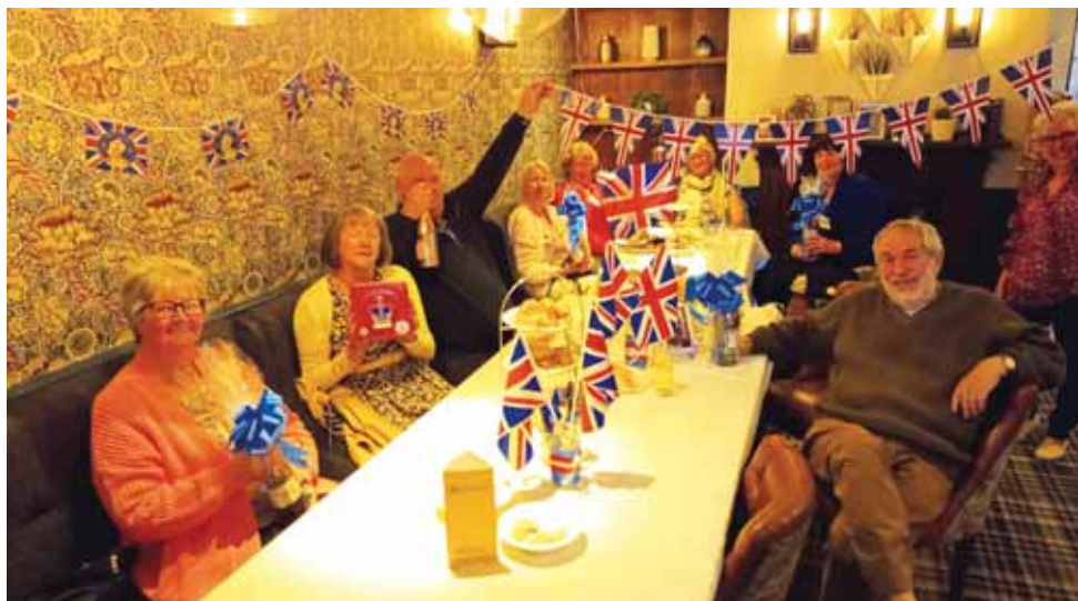
A Right Royal Tea Party at Childwall Abbey.