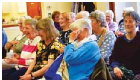
Laughter is the best medicine.