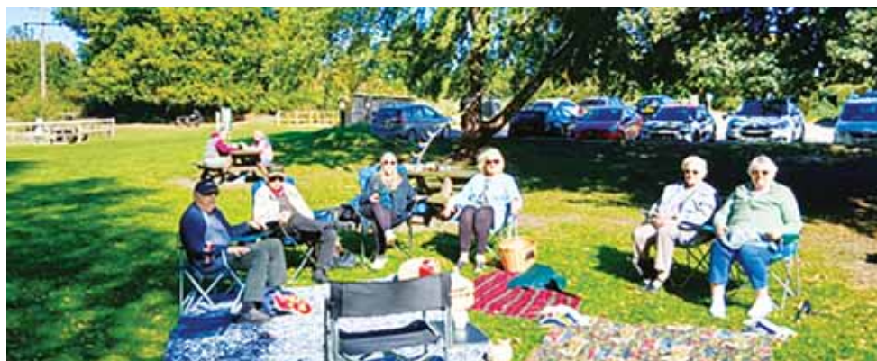
Beautiful Weather for a Picnic at Needham Lake.