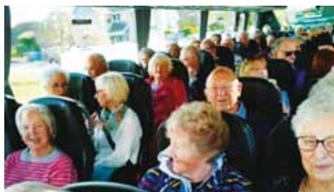
Coach to Romford Greyhound Racing.