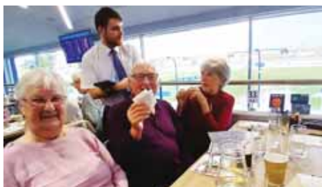
Romford Greyhound Racing.