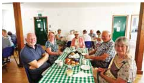
Afternoon Tea at Cornard Lock.