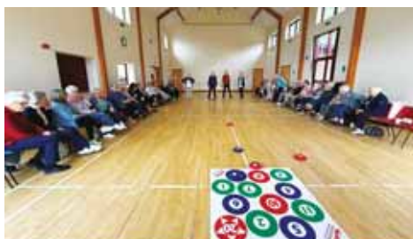
Kurling at Acton.