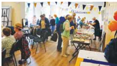
Friendship Month Bring and Buy Sale.