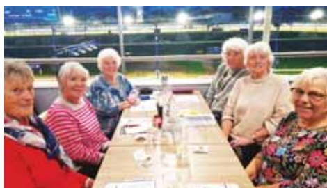
Lunch at Romford Greyhound Racing.