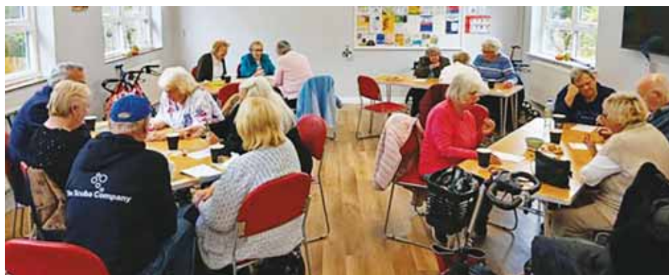
Beetle Drive Fun!