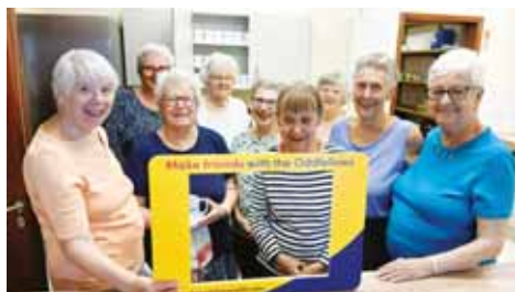
The Stars of the Show, our Volunteers.