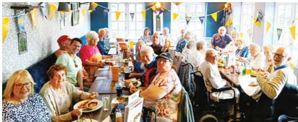
Friendship Lunch Out at the Claydon Crown.