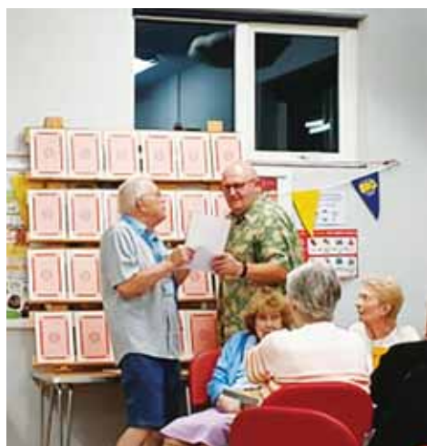
Friendly Competition at Higher or Lower.