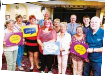
Brighouse and Huddersfield Oddfellows