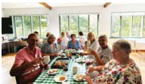
Afternoon Tea at Cornard Lock.