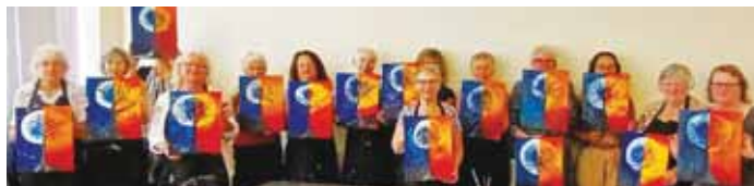
Painting with friends.

This was just one of the many events on offer to you all, from a photo shoot in the Abbey Gardens, painting, walks, talks, and wine tasting, as well as monthly coffee