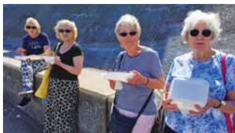
Can't see the sea for chips!