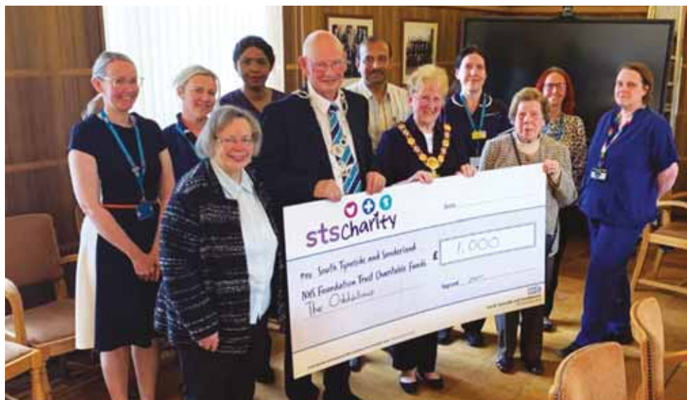
Presentation to Sunderland Eye Infirmary.