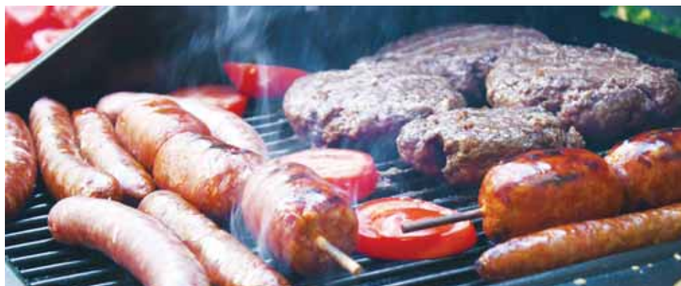
Summer Barbeque at Hart Village Hall - Saturday 1 June