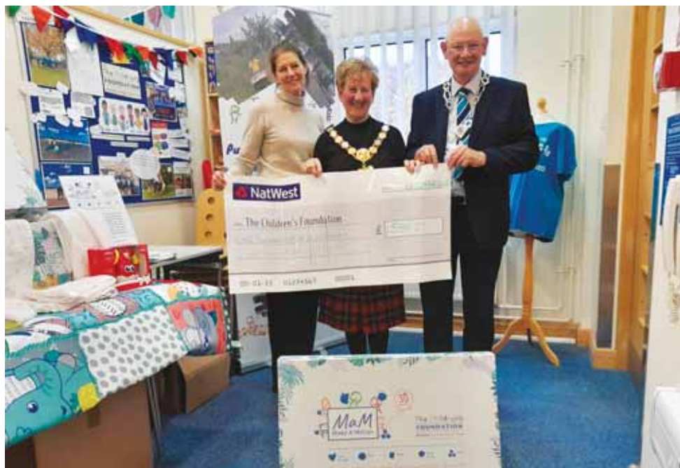
Presentation to Children's Foundation Trust at Newcastle Royal Victoria Infirmary.