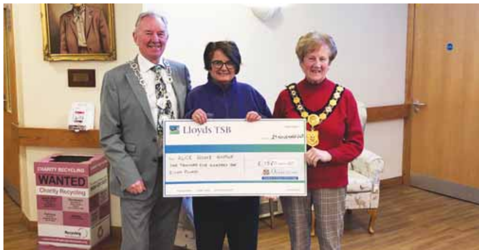
Presentation to Alice House Hospice.