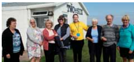
Bringing folk together on the Isle of Mona - Ormskirk and Southport Branch