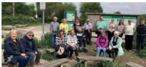
Walking in great company - Nottingham Trent Branch