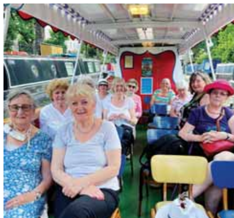
Having a good catch up on the boat

Unfortunately, Boris decided to extend the lockdown which meant that we had to postpone our welcome back afternoon tea until July. This meant that our first event was actually the river cruise of Regents Canal. We had a lovely lunch at the Earl of Camden and then boarded the Jenny Wren for a leisurely cruise to Little Venice and back. The weather was perfect and the commentary was very interesting.