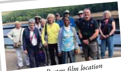
Dam Busters film location – Derwent Dam.