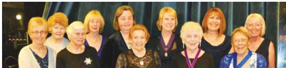
The ladies of the Reading District at the Southern Group Conference

Welcome to the Reading District of the Oddfellows. The Branches in the District have organised an exciting and varied programme of events for you all. This Events Diary is a handy guide for you to keep so that you know what is happening in your area.