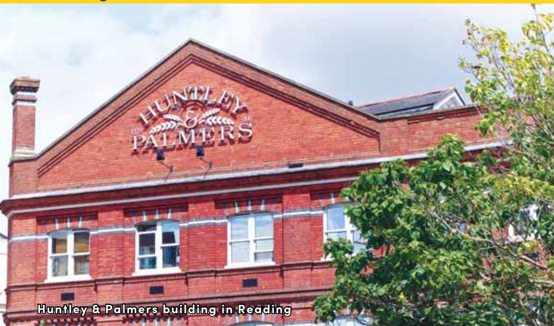
Huntley & Palmers building in Reading

Reading District (covering Reading, Maidenhead, Thatcham, Henley, Woodley, Pangbourne and Tilehurst)