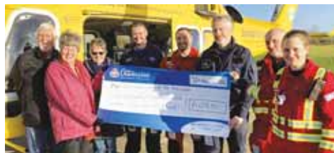
Brownsea Oddfellows raised £1,608.50 for the Dorset and Somerset Air Ambulance.

members. We know that money is tight for many people, but they still dig deep and have compassion for those in need.