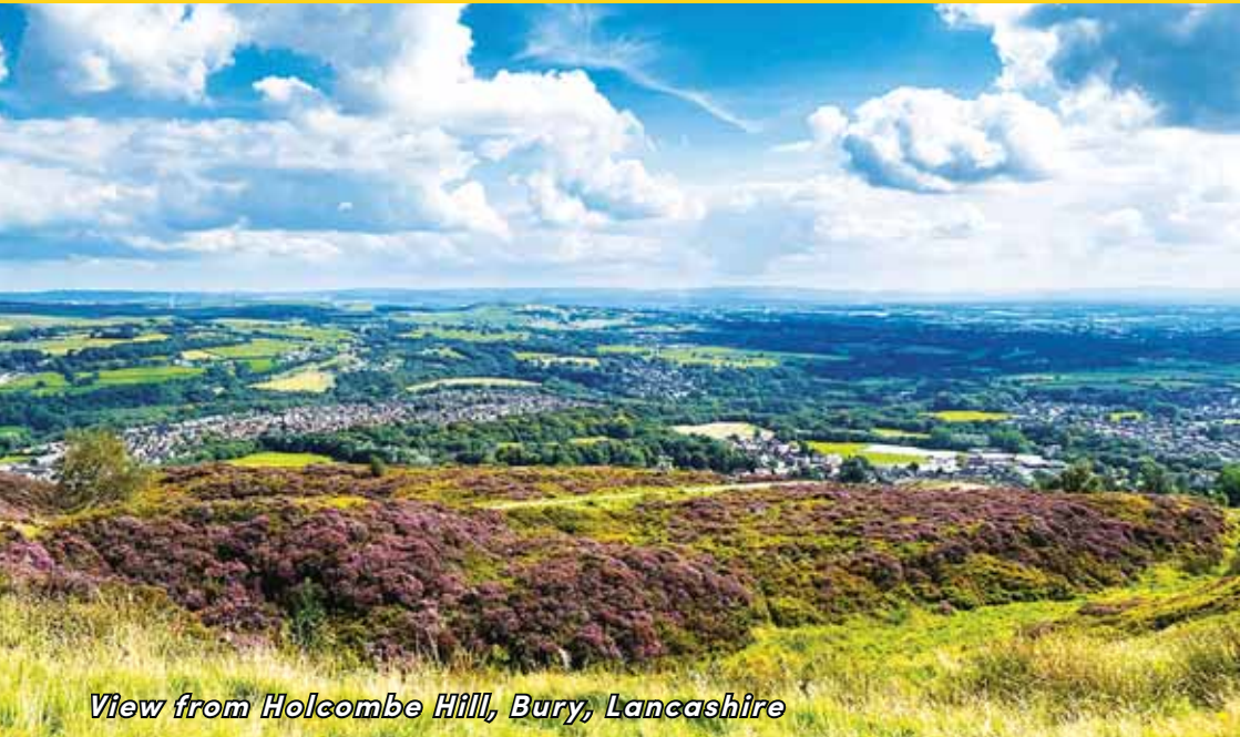
View from Holcombe Hill, Bury, Lancashire