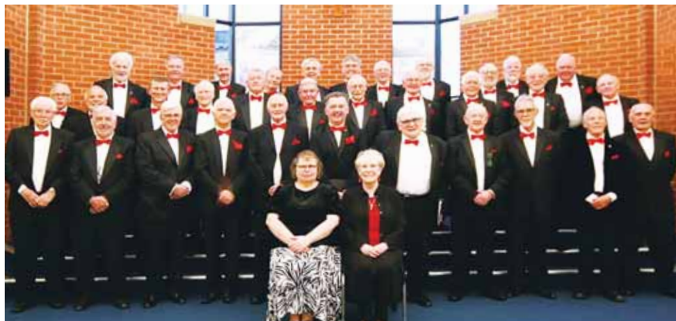
Radcliffe Male Voice Choir – Friday 30 January 2026

Welcome to the latest edition of the South East Lancashire Branch Events Diary. Members of the Branch have organised a varied programme of events for you all.