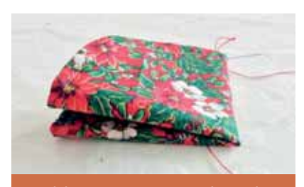
Fold into quarter and mark to stitch middle edges together. First as folded in half and then as folded in quarters. Edges only.

10. Turn the pockets out to form the star effect (see photo of front and back). Pull and flatten to your desired effect.