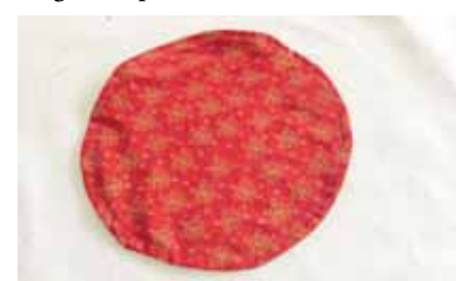
Turn inside out, close gap with top stitching all the way round.

6. Stitch again close to the edge which will close the gap and form a secure edge (see photo).