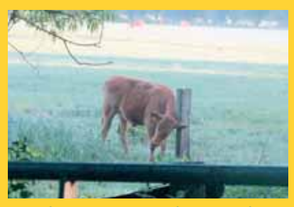
On the water meadows early morning - Sue Ayres, Runner-up