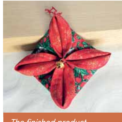
The finished product.

12. Add a button (or in my case a bell) to finish the tree decoration (guess where the bell came from - a well known chocolate item).