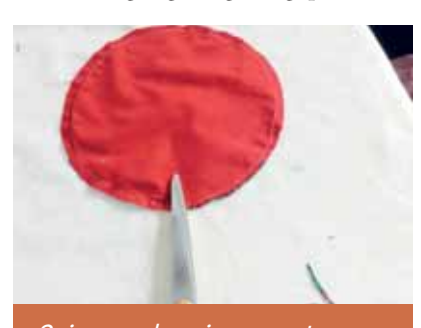
Scissors showing gap to allow for turning inside out.