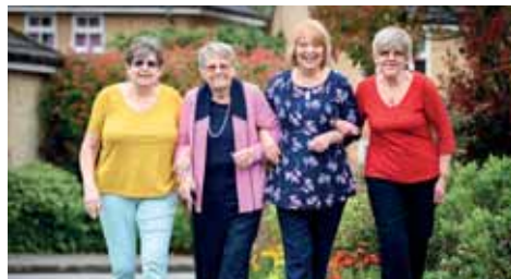
A little neighbourly spirit goes a long way

So why not spread that net of kindness a little wider, by extending your hand of friendship to those who live around you? If you notice that your neighbour lives alone, has a lot on their plate, or doesn't often get many visitors, then why not stop by to see if you can help? Colder seasons provide a great opportunity to drop a card through their door with your contact details for them to give you a call if they're ever