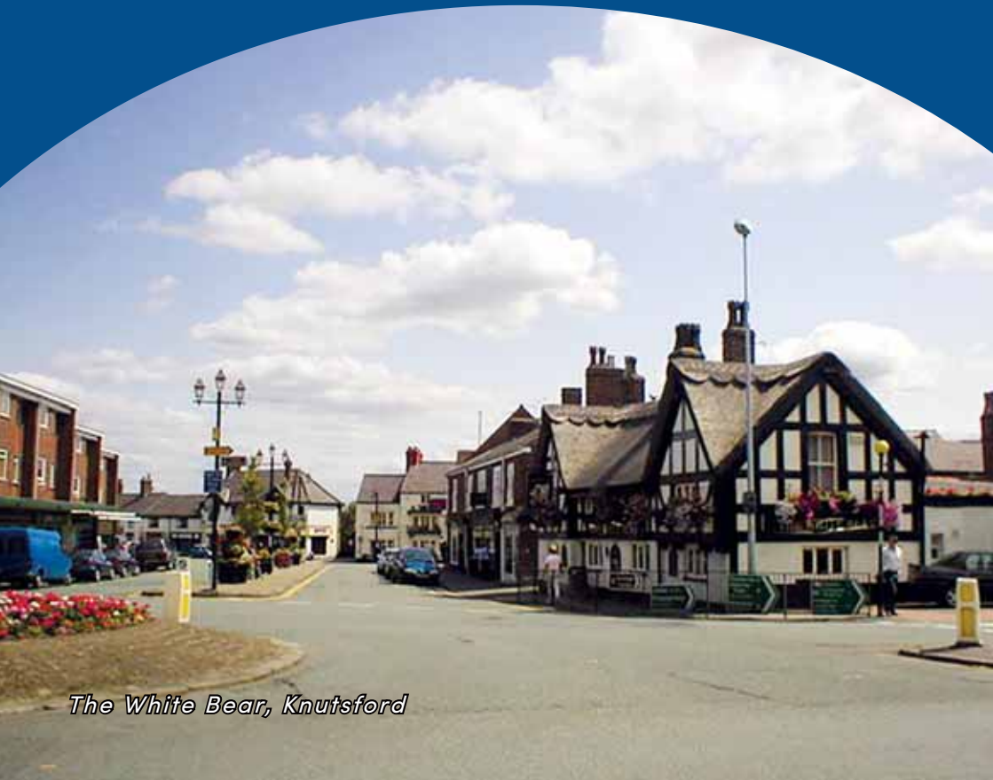
The White Bear, Knutsford