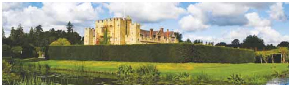
Hever Castle and Craft Fair - Saturday 10 September