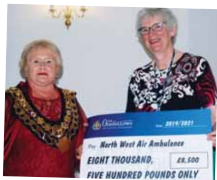
South East Lancashire Branch

Oddfellows CEO, Jane Nelson, added: "It always astounds me when we look at the collective yearly fundraising figure. The generosity of our members and Branches, especially at such times where household budgets are becoming increasingly tight and unpredictable, is incredible.