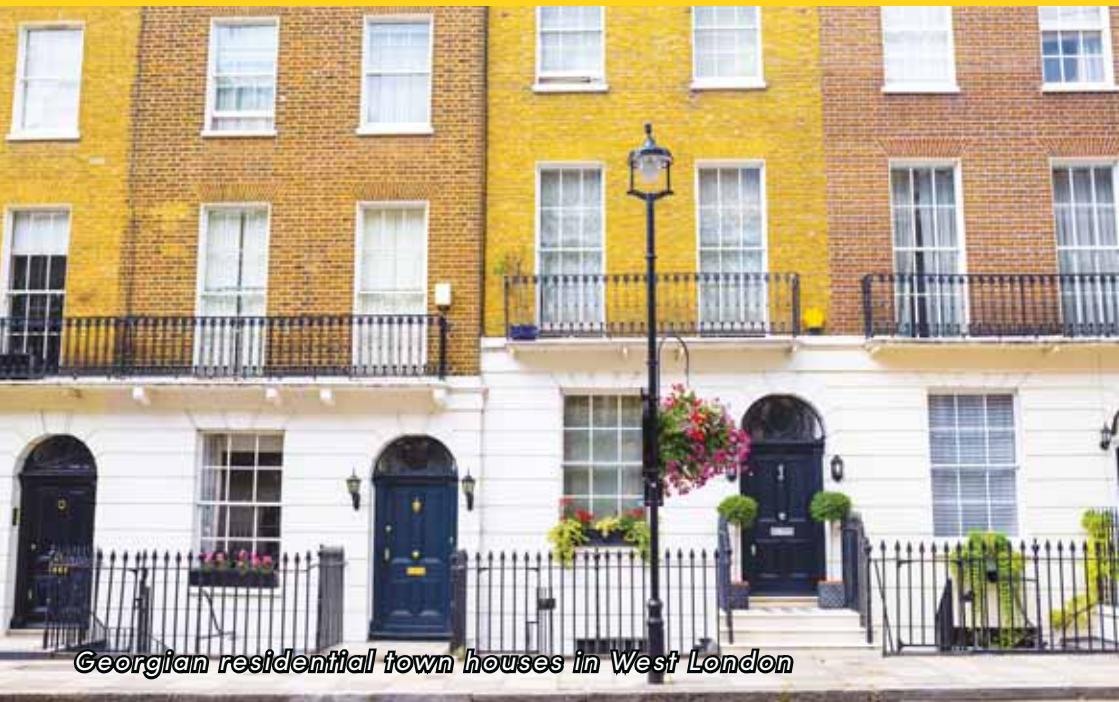
Georgian residential town houses in West London