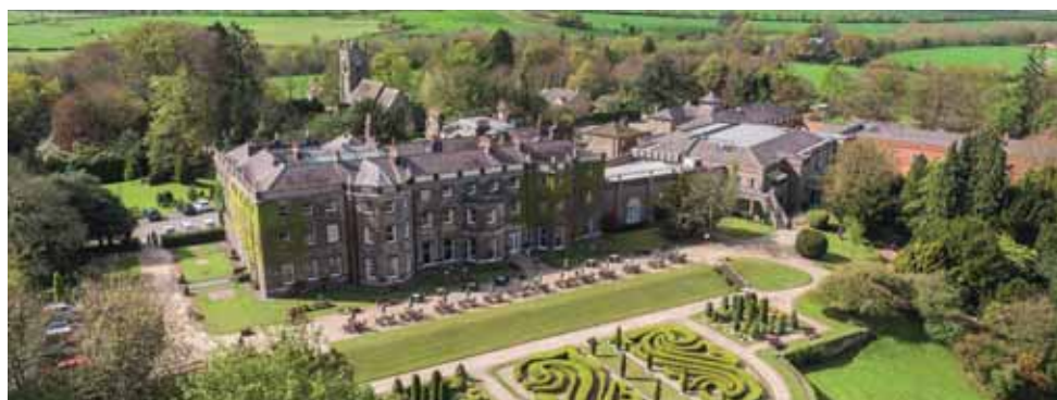
The spectacular grounds at Nidd Hall, Harrogate