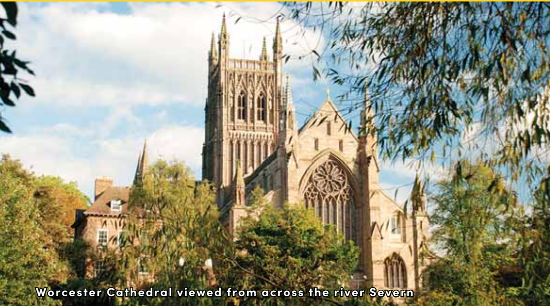
Worcester Cathedral viewed from across the river Severn