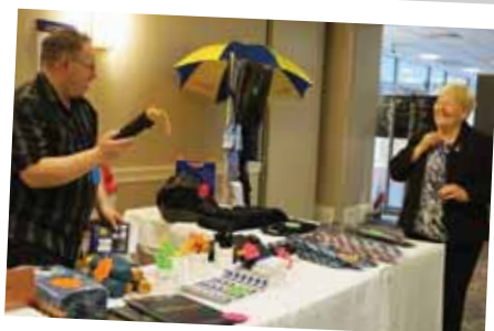
An array of Oddfellows merchandise was available for members to purchase

These include the Ken Hughes Silver Salver Award, won this year by Pride of Woolwich Branch, and the Lillian Ogden Recruitment trophy, awarded to Ormskirk and Southport Branch. Members can help their Branches to win awards too, as we also present the Refer a Friend Awards, to recognise Branches which have a great network of strong member advocates.