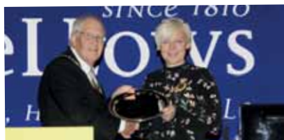
The "Refer a Friend" Award for the highest number of member advocates was awarded to Ormskirk and Southport Branch, with 31 members recruiting a new member in 2018