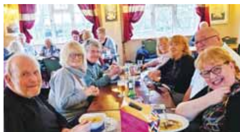
Lunch at The Woolpack