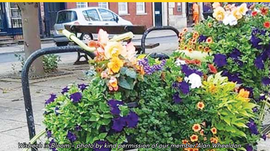
Wisbech in Bloom