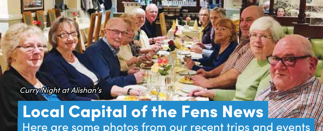
Curry Night at Alishan's