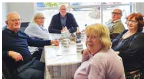
Breakfast at Lillie's