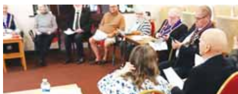
Annual Summoned meeting