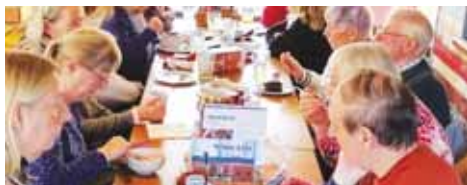
The Little Owl pub – Chester