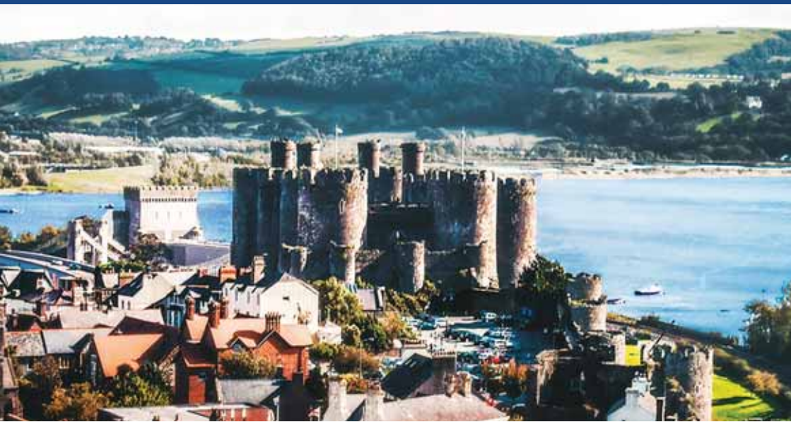
Conwy Castle, Conwy, Wales.