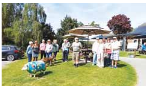
Chirk aqueduct walk