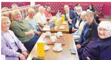
First Anglesey coffee morning