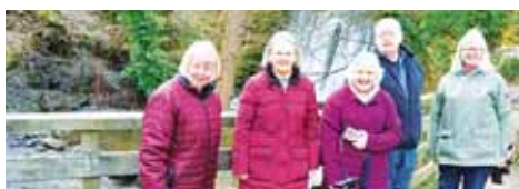
Wepre Park walk