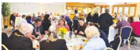
District Sunday lunch