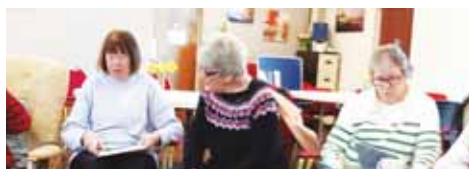
Saltney coffee morning