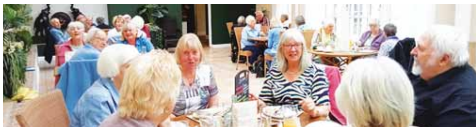
The Orangery, Derwen College