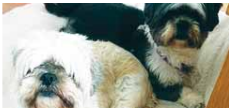
Ark Angels Animal Rescue

They provide a safe haven for dogs, cats, horses and wildlife in need, ensuring they receive the love and medical attention and training necessary to find their perfect