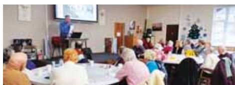
Saturday social afternoon