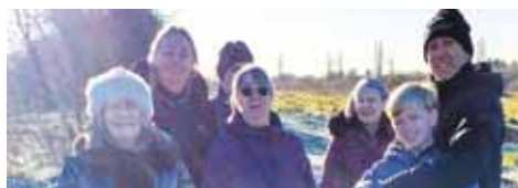
Countess of Chester Country Park