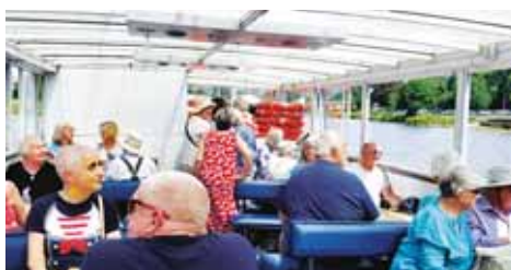
River Dee boat trip