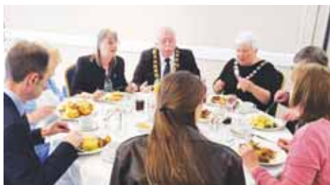
District Sunday lunch