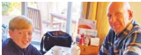
The Little Owl pub – Chester