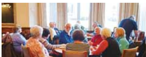
Llandudno coffee morning