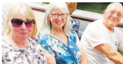
River Dee boat trip