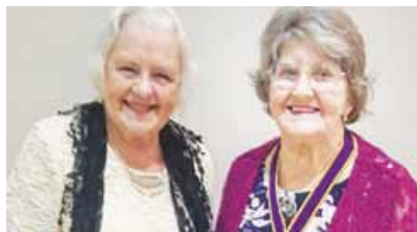
District Sunday lunch