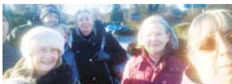
Countess of Chester Country Park