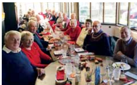
A great get together at The Kilton Inn, 2018