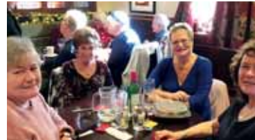
Past Christmas Events