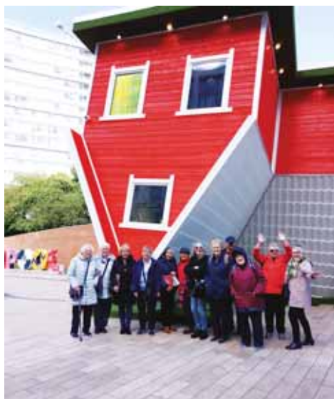
At the Upside Down House near Liverpool One.