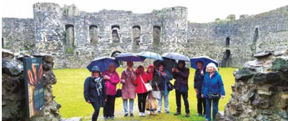
Singing in the Rain (not quite) at Beaumaris.