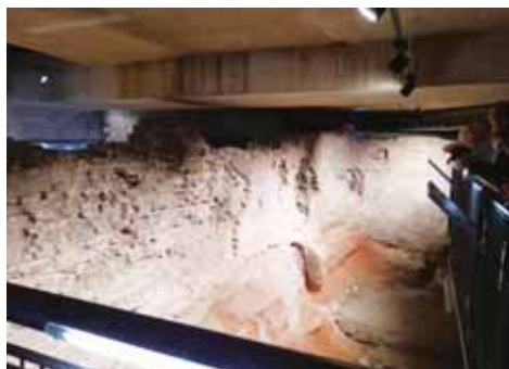
Ooh that’s deep! Looking down into the depths of where the original dock was.

There is nothing better than learning about your own area. We headed off underground for a really interesting guided tour of Liverpool’s very first dock. Nestled below