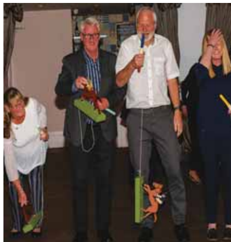
Horse racing went well – ish!!