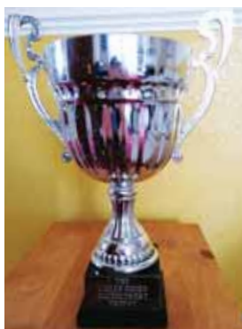
The Lilian Ogden Recruitment Trophy – which is heavier than it looks!

if you aren't receiving this, do get in touch and let us know so you can be added to the listing.