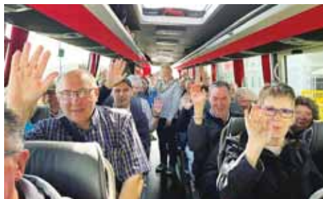
Oddies on the coach to Portmeirion

As well as business, attendees enjoyed a range of social activities, with Oddfellows Brass putting on another wonderful performance.