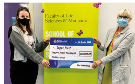
Lupus research pushes through pandemic