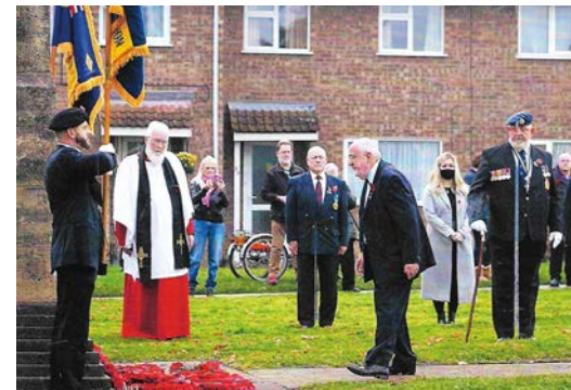
War Memorials in Wisbech and Littleport