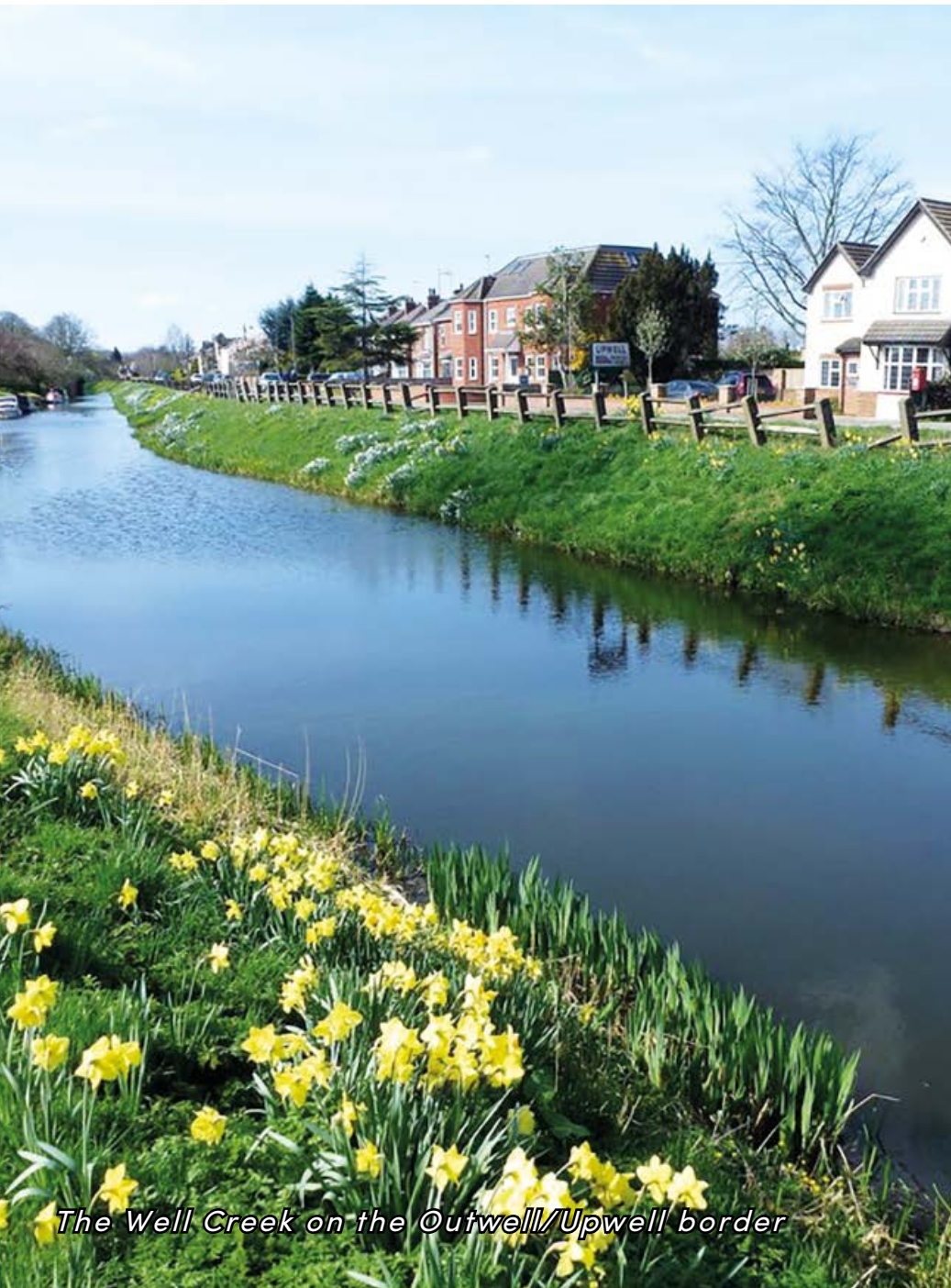
The Well Creek on the Outwell/Upwell border