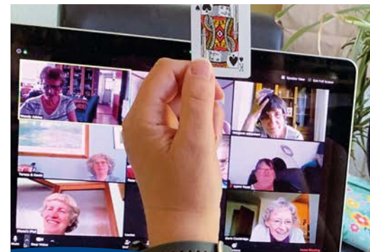
Social distancing doesn't mean no socials