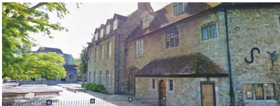
The Friars Tea Rooms and Gift Shop in Aylesford - Friday 22 April