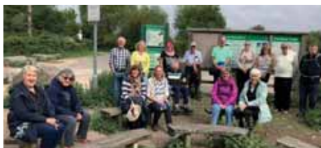
Walking in great company - Nottingham Trent Branch