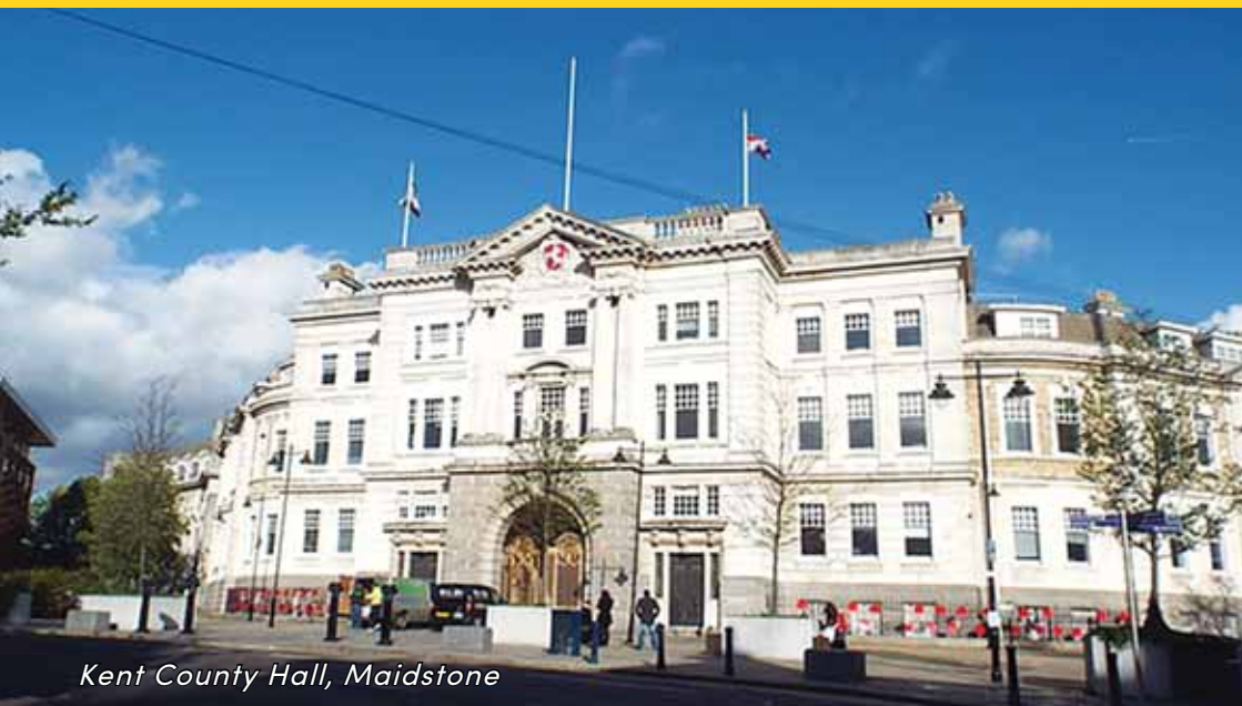
Kent County Hall, Maidstone