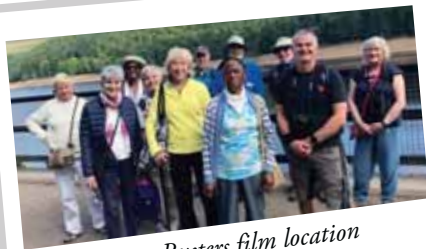
Dam Busters film location – Derwent Dam.