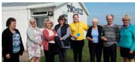
Bringing folk together on the Isle of Mona - Ormskirk and Southport Branch