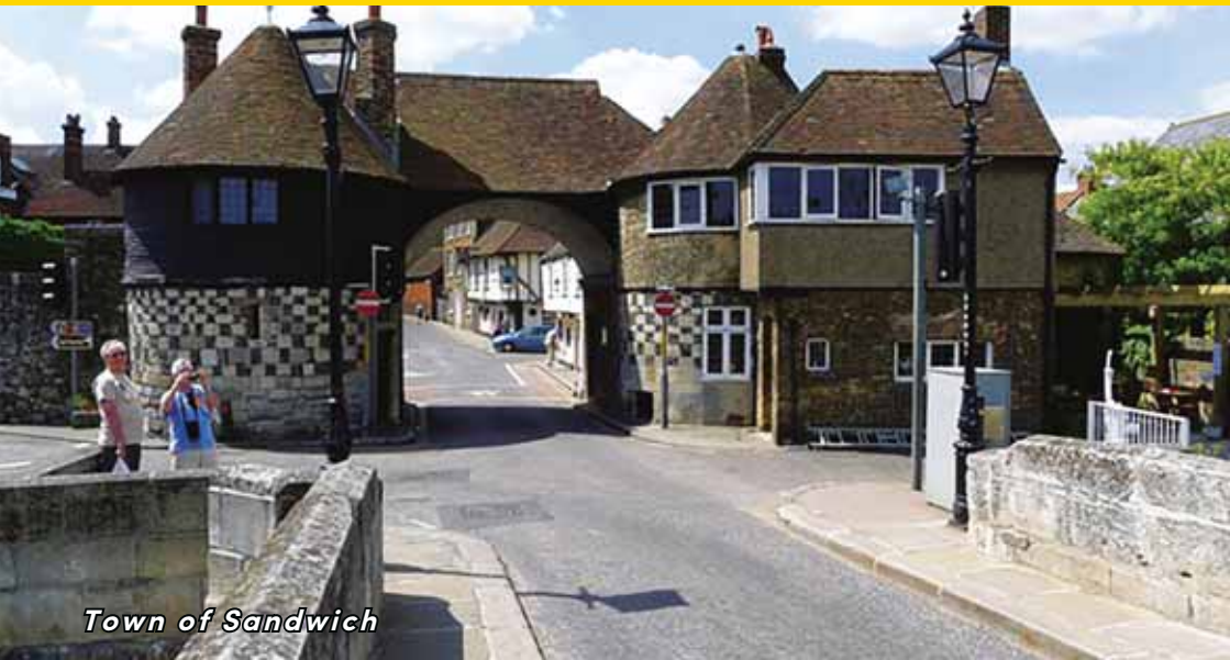
Town of Sandwich