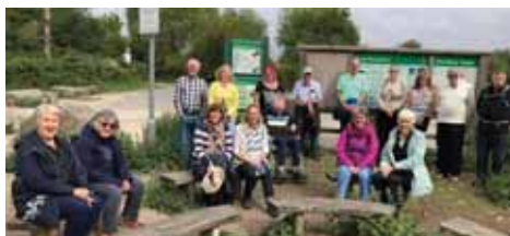
Walking in great company - Nottingham Trent Branch