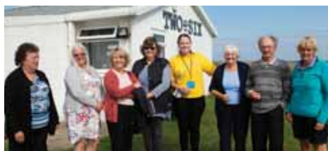
Bringing folk together on the Isle of Mona - Ormskirk and Southport Branch