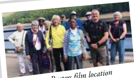
Dam Busters film location – Derwent Dam.