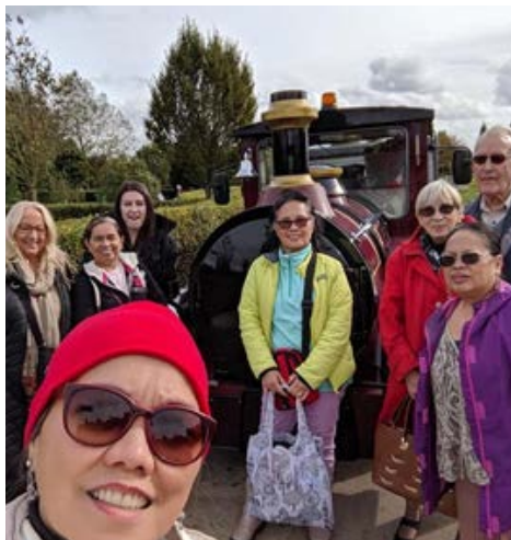
Visit to National Memorial Arboretum