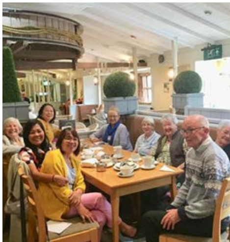
One of the many coffee mornings