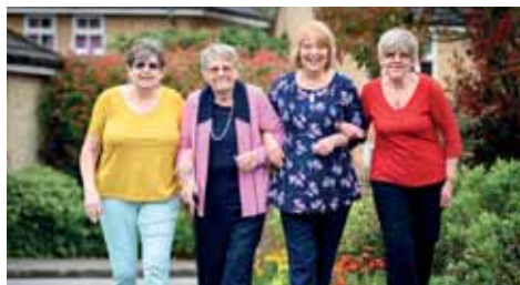
A little neighbourly spirit goes a long way

So why not spread that net of kindness a little wider, by extending your hand of friendship to those who live around you? If you notice that your neighbour lives alone, has a lot on their plate, or doesn't often get many visitors, then why not stop by to see if you can help? Colder seasons provide a great opportunity to drop a card through their door with your contact details for them to give you a call if they're ever