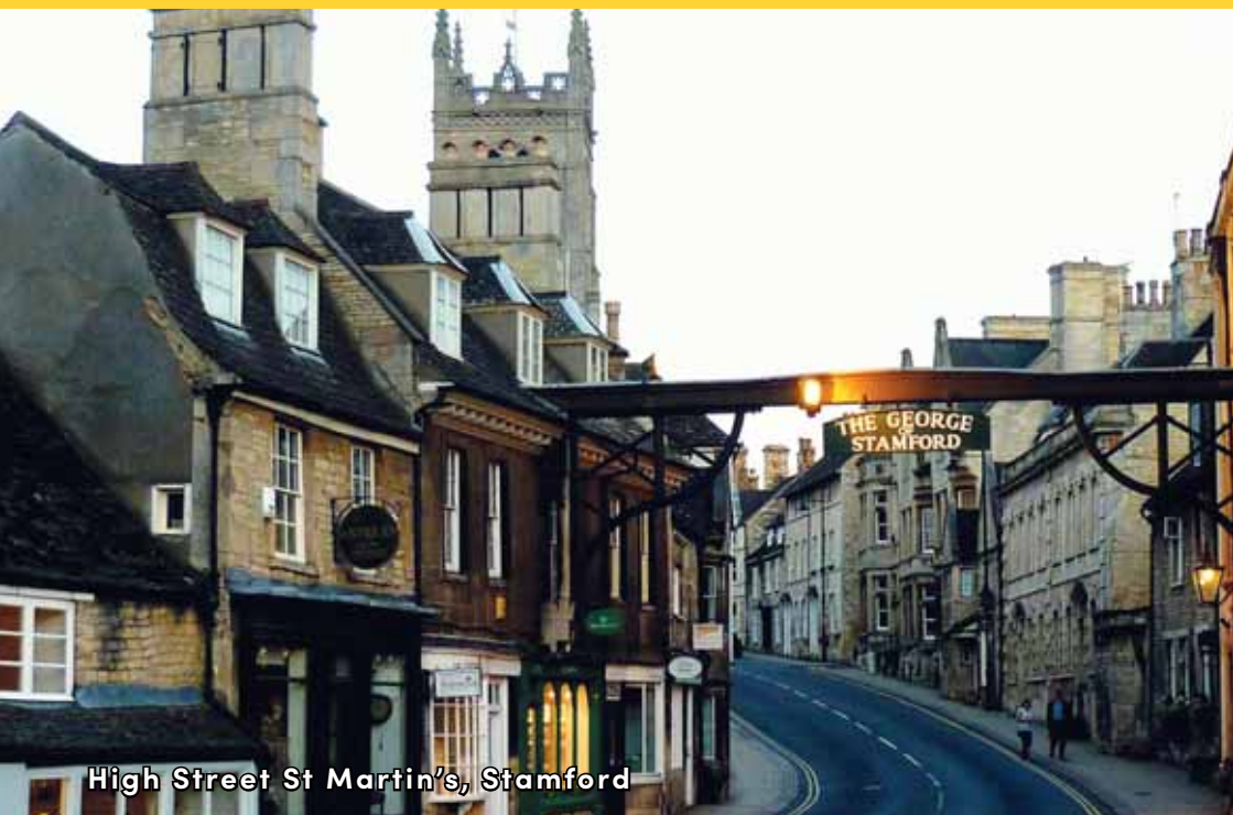
High Street St Martin's, Stamford