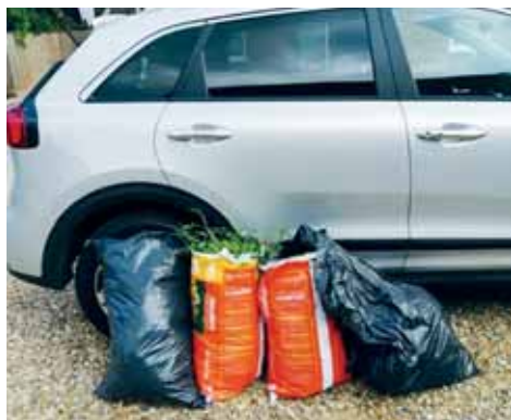
Fits in to these

Is there someone you know who'd enjoy what we do?