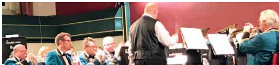
Oddfellows Brass Band – Saturday 2 October