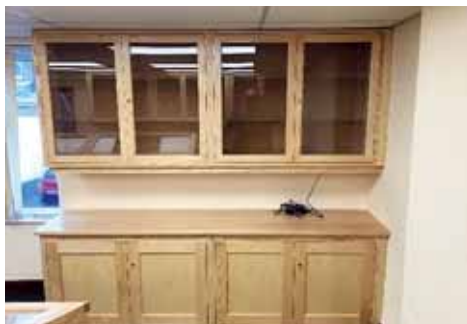
Wall and base units fitted in the museum

Along with this we will then put into the storage units the items for our