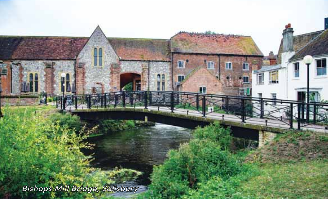
Bishops Mill Bridge, Salisbury