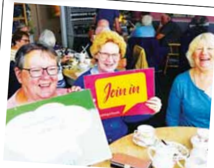
Heart of the West Oddfellows