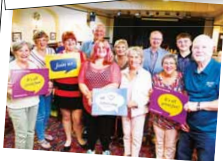
Brighouse and Huddersfield Oddfellows