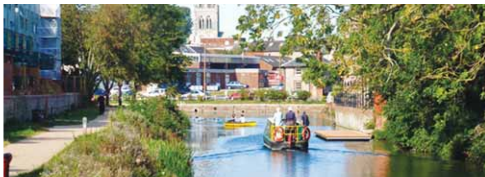
Chichester Canal – Saturday 12 August

Welcome to the latest edition of your Out and About Magazine for Brighton & Sussex Branch