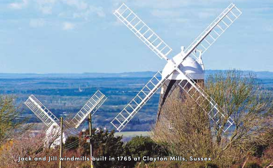
Jack and Jill windmills built in 1765 at Clayton Mills, Sussex