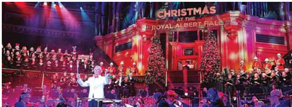
The Royal Albert Hall Carol Concert