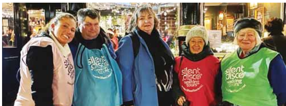
The Christmas Disco walking tour