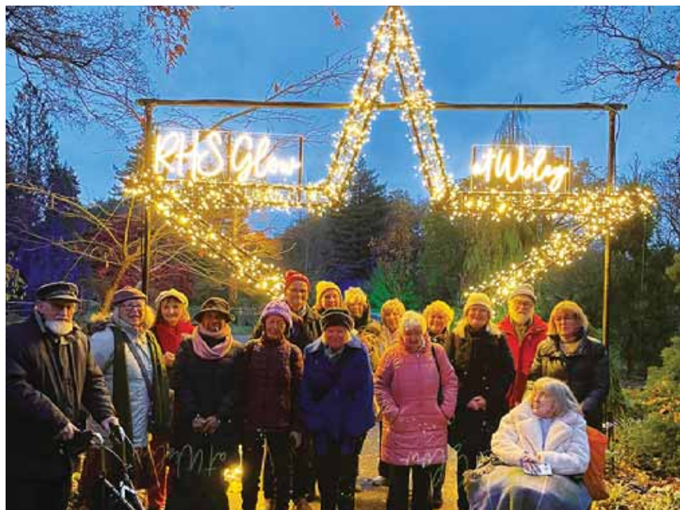
We had a wonderful evening at Wisley exploring the winter lights trail