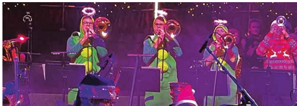
A ha pea Christmas at The Royal Albert Hall