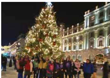
The Christmas Disco walking tour was a fun filled evening!