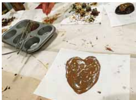
chocolate making workshop