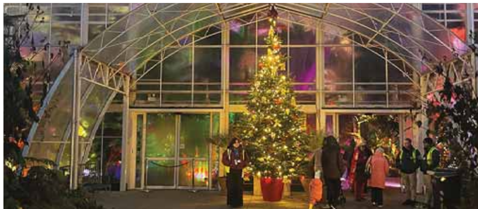
Wisley exploring the winter lights trail