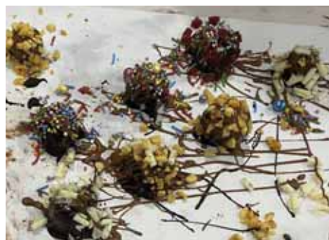
We had quite a messy time at the chocolate making workshop