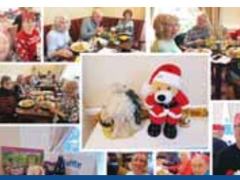
Friendship Lunchtime Get-Togethers