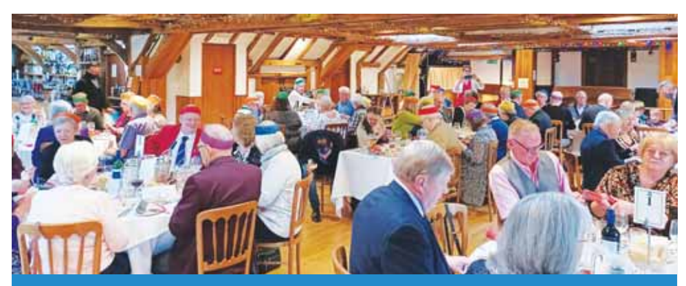
Members having fun at High Rocks

A week earlier, thirty-four members sat down to a delicious three course Christmas lunch at the Royal Victoria Hotel in St Leonards on Sea. A raffle was held that raised £94 for local charity St Michael's Hospice. Just before Christmas a cheque for £250 was sent to St Michael's Hospice from the proceeds of all the raffles held in Bexhill since July.