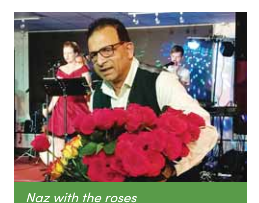
In March, thirty-eight members enjoyed the return of the Smokin' Mojos who have entertained us previously at our Dinner Dance last September and before that at The Bull at Benenden. The four band members have a diverse and interesting song list and play a mix of Blues, Soul, Country and Rock. Some of the tracks that they performed, encouraging members to take to the dance floor, were Wishing Well, Chasing Cars, Purple Rain, Honky Tonk Woman, Steamy Windows, 9 To 5, Sweet Caroline and Islands In The Stream.