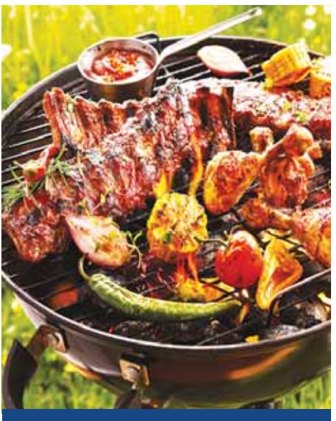
Barbecue - Wednesday 20 July