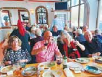
Earl of Cottenham Branch