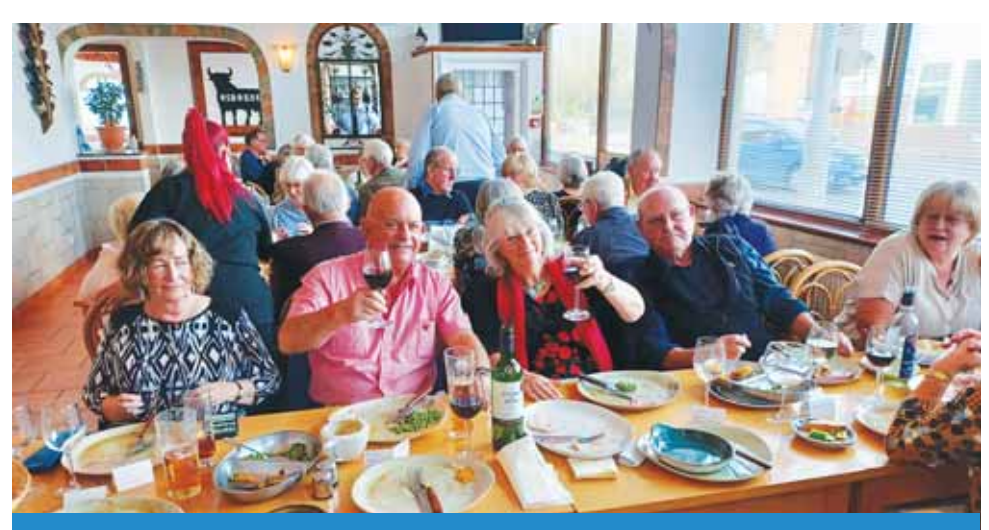
Members enjoying La Farola