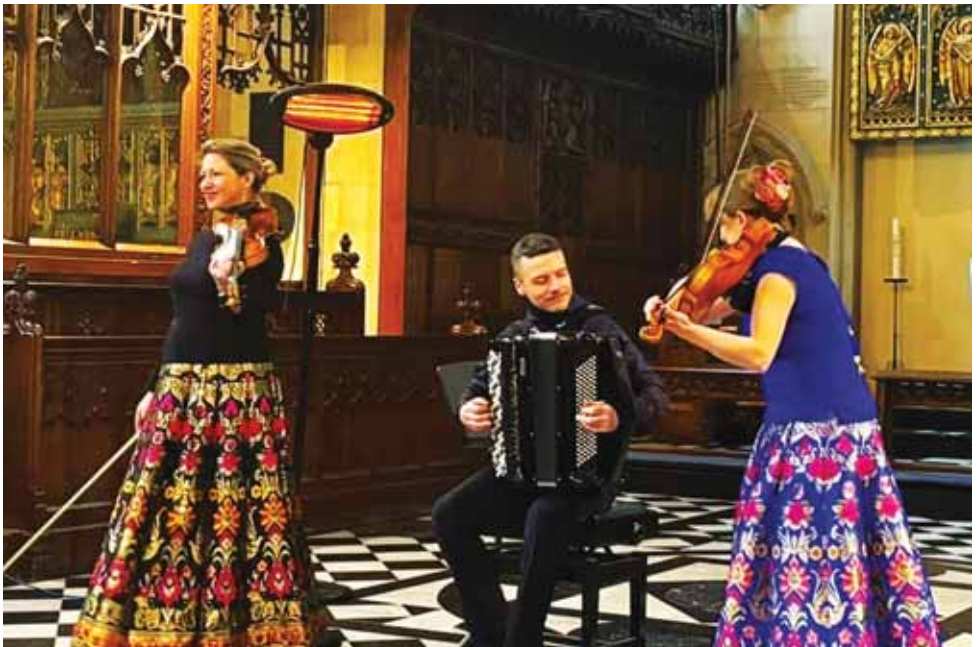
Photo of the internationally acclaimed Kosmos Ensemble by Jackie Lancaster.

This outdoor event was cancelled due to heavy rain.