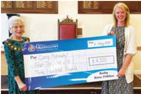
Reading Oddfellows donated £4,300 to Camp Mohawk

Oddfellows branches and members are avid fundraisers. In 2025, more than £148,000 was handed over to a huge range of wonderful causes throughout the country.