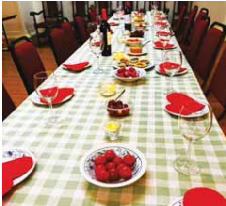
Valentine's table