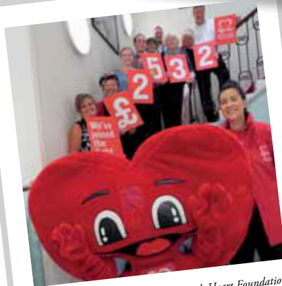
Oddfellows raise £2532 for the British Heart Foundation