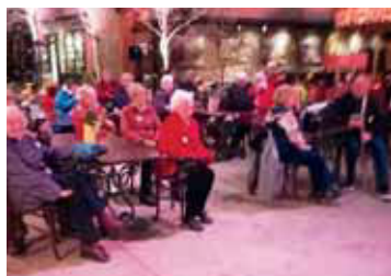
Trip to Thursford