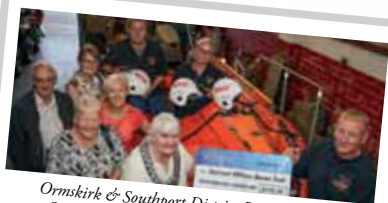
Ormskirk & Southport District Branch present Southport Offshore Rescue Trust with £775