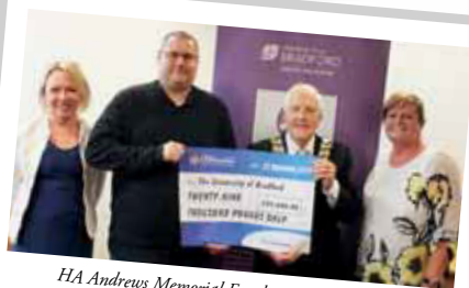
HA Andrews Memorial Fund presents University of Bradford with £29,000