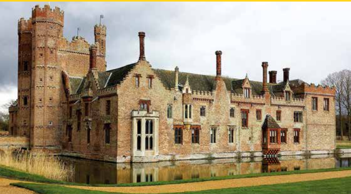
Oxburgh Hall - viewed from the west

Making friends across King's Lynn and West Norfolk