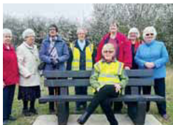
Walks from the office