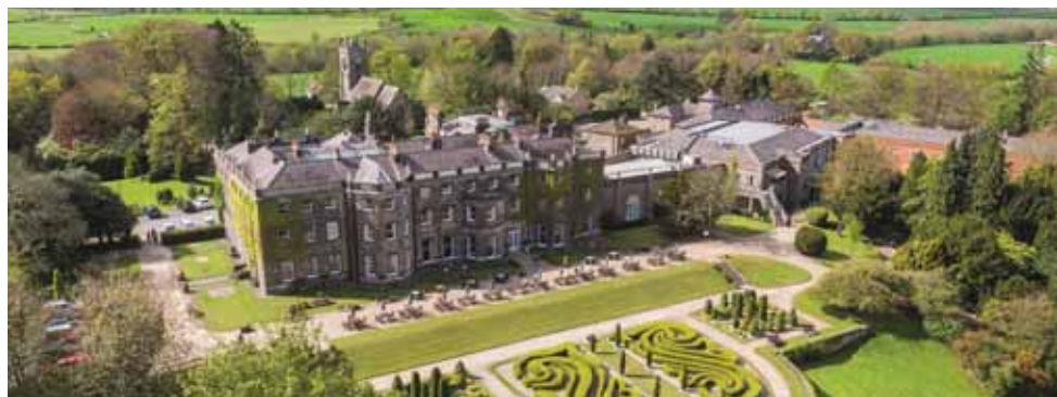
The spectacular grounds at Nidd Hall, Harrogate