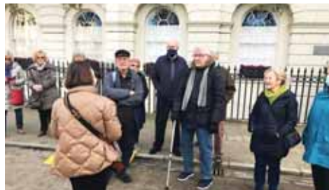
Members in Fitzrovia