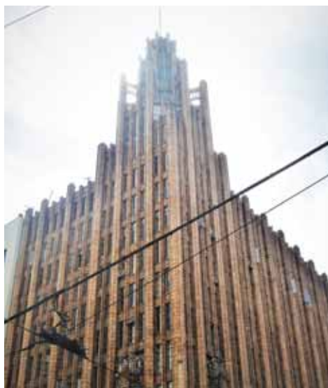
The magnificent building

Situated on the corner of Swanston and Collins Streets, the Manchester Unity Building is one of Melbourne's most iconic Art Deco landmarks. It was built in 1932 for the Manchester Unity Independent Order of Odd Fellows. Melbourne architect Marcus Barlow was inspired by the 1927 Chicago Tribune Building. His design incorporated a striking New Gothic style façade of faience tiles with ground-floor arcade and mezzanine shops, café and rooftop garden. The arcade houses the marble interior, beautiful friezes and restored lift.