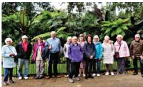
Members enjoying St James's Park