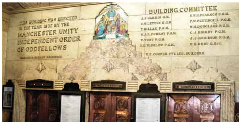
The marble interior, beautiful friezes and restored lift