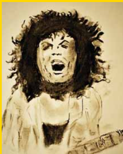
Sketch by Paul Fitton