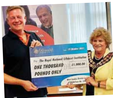
West London Branch