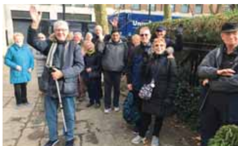
Members in Fitzrovia