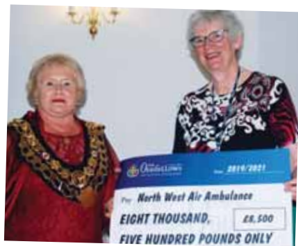
South East Lancashire Branch

Oddfellows CEO, Jane Nelson, added: "It always astounds me when we look at the collective yearly fundraising figure. The generosity of our members and Branches, especially at such times where household budgets are becoming increasingly tight and unpredictable, is incredible.